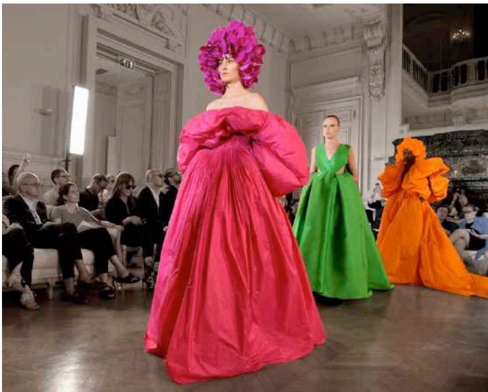
Valentino, haute couture fall 2018

Kunstmuseum Den Haag (The Netherlands) has changed its exhibition schedule for this autumn. The Dior exhibition has been postponed to autumn 2021, but fashion fans will be able to console themselves with Fashion in Colour! from 26 September 2020 to 28 February 2021. Immerse yourself in colour and enjoy the creations of leading Dutch and international designers with colourful costumes dating from the eighteenth century to the present day. The exhibition will be drawn primarily from the museum's own large, diverse collection, and will include some items that have never been on public display before. Additional exhibits will come from recent colourful collections by designers such as Claes Iversen, Bas Kosters, Iris van Herpen, David Laport, Christopher John Rogers, Hanifa and Valentino. And, of course, there will also be some colourful designer facemasks, highlighting the pandemic's immediate impact on fashion.