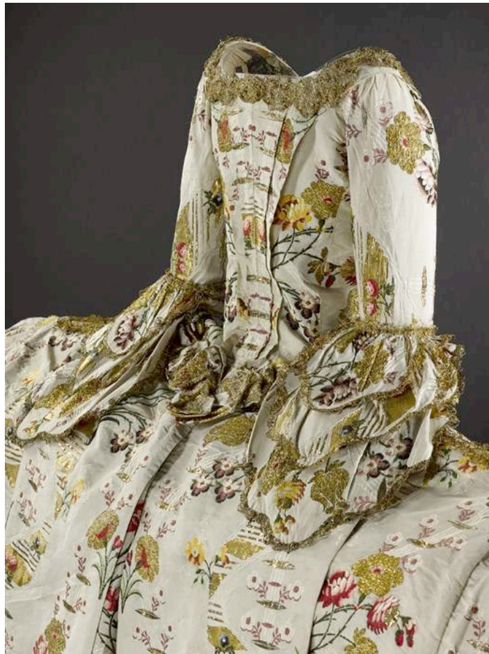
Court Mantua of brocaded silk and gold lace, British, c1750s. K.2013.67.1+2

The week commencing 15th June, National Museums Scotland #MuseumAtHome social media campaign will revolve around a week of fashion, including 'Ask Me Anythings' with their Fashion and Textile curators and highlighting key objects from the 50,000 strong fashion collection. From a sumptuous 18 th century court mantua to timeless creations by internationally renowned British fashion designer, Jean Muir, delve into the museum's wardrobe. Please visit https://mode.nms.ac.uk/ for further highlights on display in the National Museum's Fashion & Style gallery and a chance to step behind the glass with 360-degree photography.