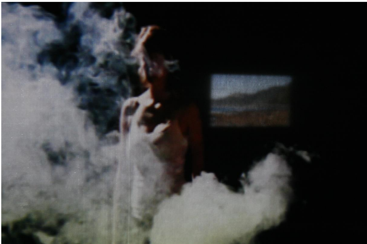
Figure 3: Transformation 1 and 2 by Rosemarie Allaert photographed at the exhibition Critical Costume 2015.

Another artistic research project entitled Transformation 1 and 2 (2014) was developed at Amsterdam School of the Arts by the Belgian emerging designer Rosemarie Allaert inspired by Ophelia's fragility and vulnerability. In Transformation , Allaert was interested in exploring the relation between performer and costume, skin and ethereal material, focusing on how smoke as a constantly evolving material can contribute to the costume, to the performer and the performance as a whole. The project developed as a dance between the performer and the material around her (Figure 3).