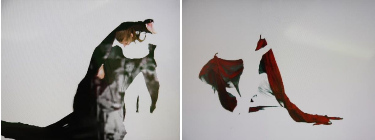
Figure 6 (6a, 6b): Digital Character Design (2015), workshop conceived and supervised by Sofia Pantouvaki. Dissolving and disappearing bodies through costume and green screen digital technologies.

At Aalto University, I organised an experimental workshop entitled Digital Character Design (2015), in which this challenge became a starting point to investigate the potential of dissolving bodies (Figure 5). The workshop addressed questions of materiality and virtuality in the context of costume design by discussions, lectures and hands-on work. The creative work undertaken involved experimentation with the combination of physical (fabrics and tangible objects) and virtual materials (digital software) to design multi-layered characters and costumes. The work focussed specifically on mixing analogue fabrics with green screen technologies to create dissolving and disappearing bodies through designing 'costumes' with the combination of these materials (Figure 6a, 6b).