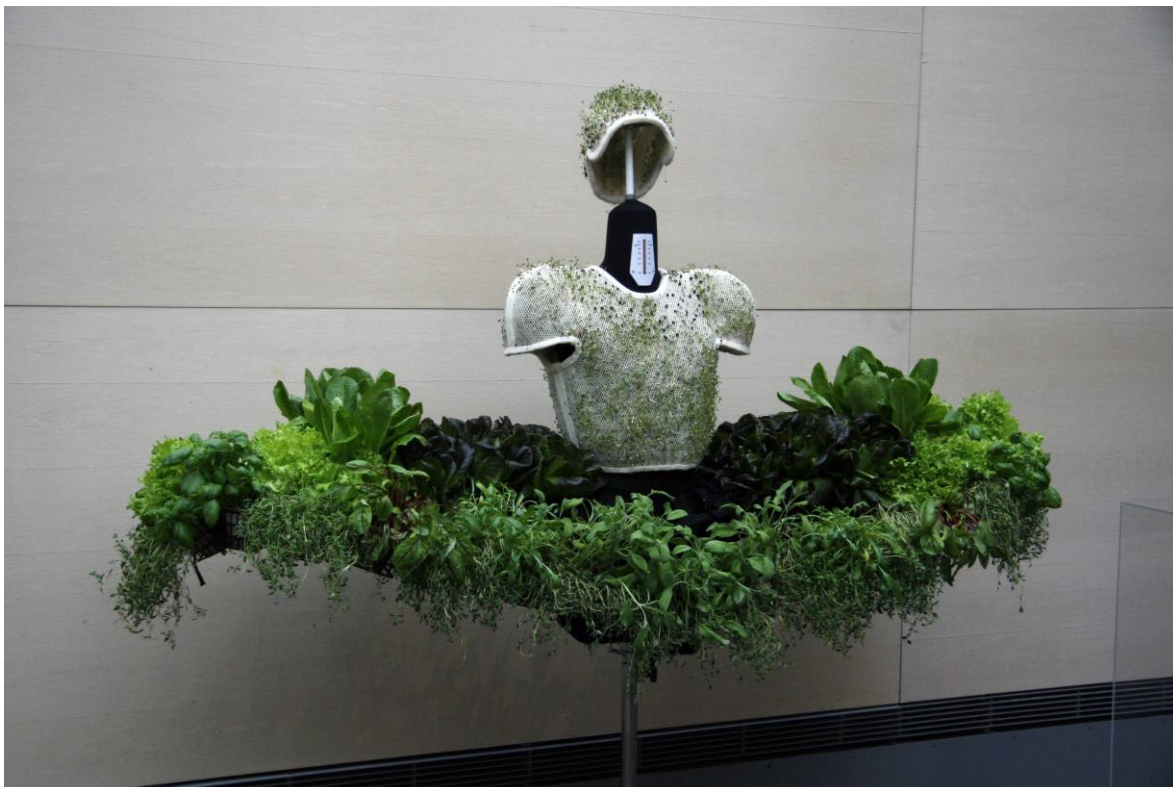
Figure 2: Grow (2015) by Liisa Pesonen exhibited at the Critical Costume 2015 exhibition, Aalto University, Helsinki.

Further to this project, Pesonen moved a step ahead by proposing real vegetables as the main material for her costume entitled Grow (2015). This became a wearable growing entity that transformed from one day to another. The costume was displayed at the Critical Costume 2015 exhibition, served with olive oil and vinegar. Its materials consisting of a variety of salads and herbs created an edible performance through interaction with the audience who were invited to taste it (Figure 2).