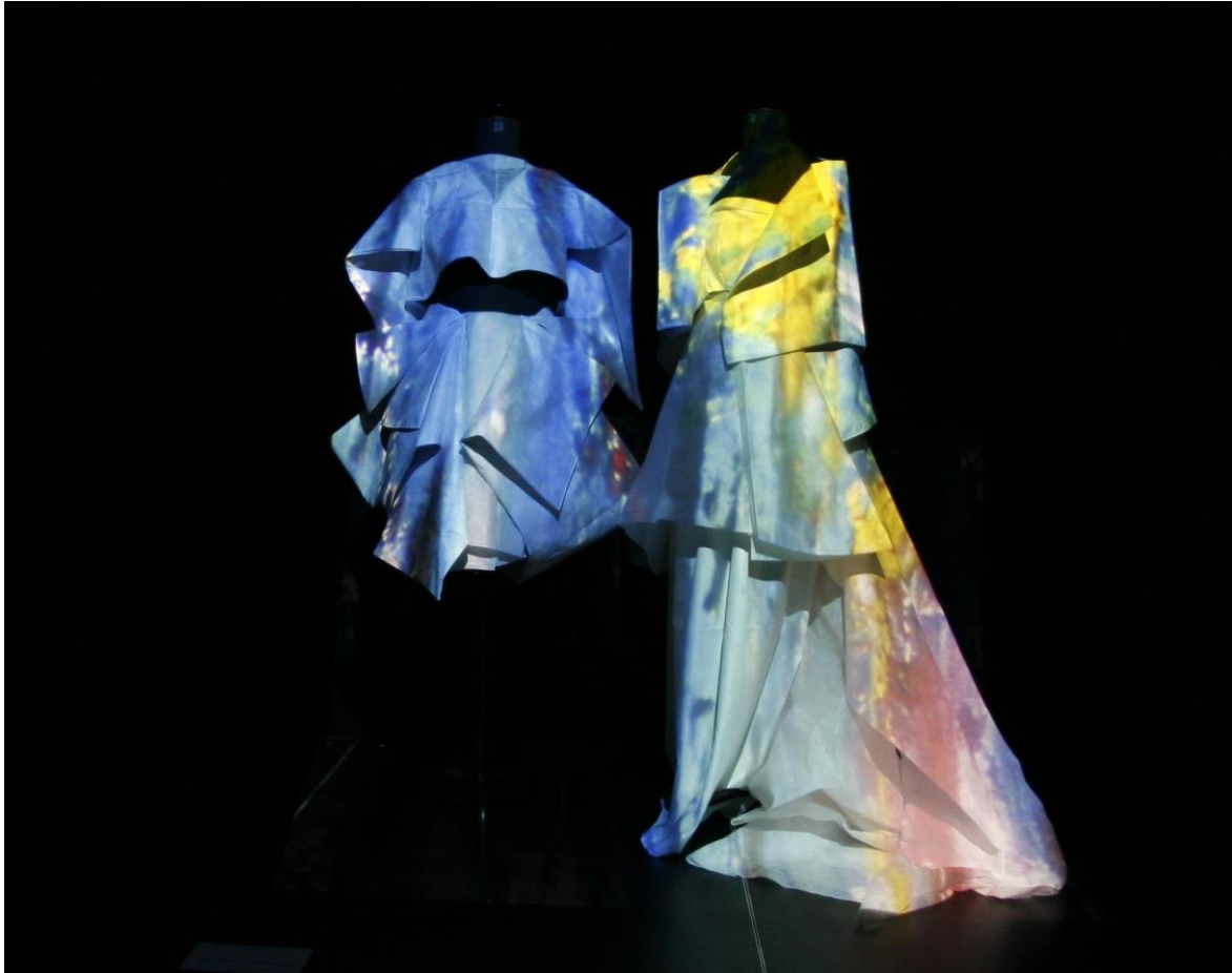
Figure 4: The Poetry of Nature (2015), costumes for Midsummer Night's Dream by Zsófia Geresdi photographed at the exhibition Critical Costume 2015 .

costume are still nascent. Contemporary digital applications in the field of costume concentrate primarily on projections, used to 'paint' and create textures, mapping multiple images on costumes used as projection surfaces or deploying projected animation to extend the costume in the space. As an example, the costumes of the Hungarian designer Zsófia Geresdi do not exist without projection: she uses the forms of her costumes as a three-dimensional canvas that hosts layers of colour and texture to create characters (Figure 4).