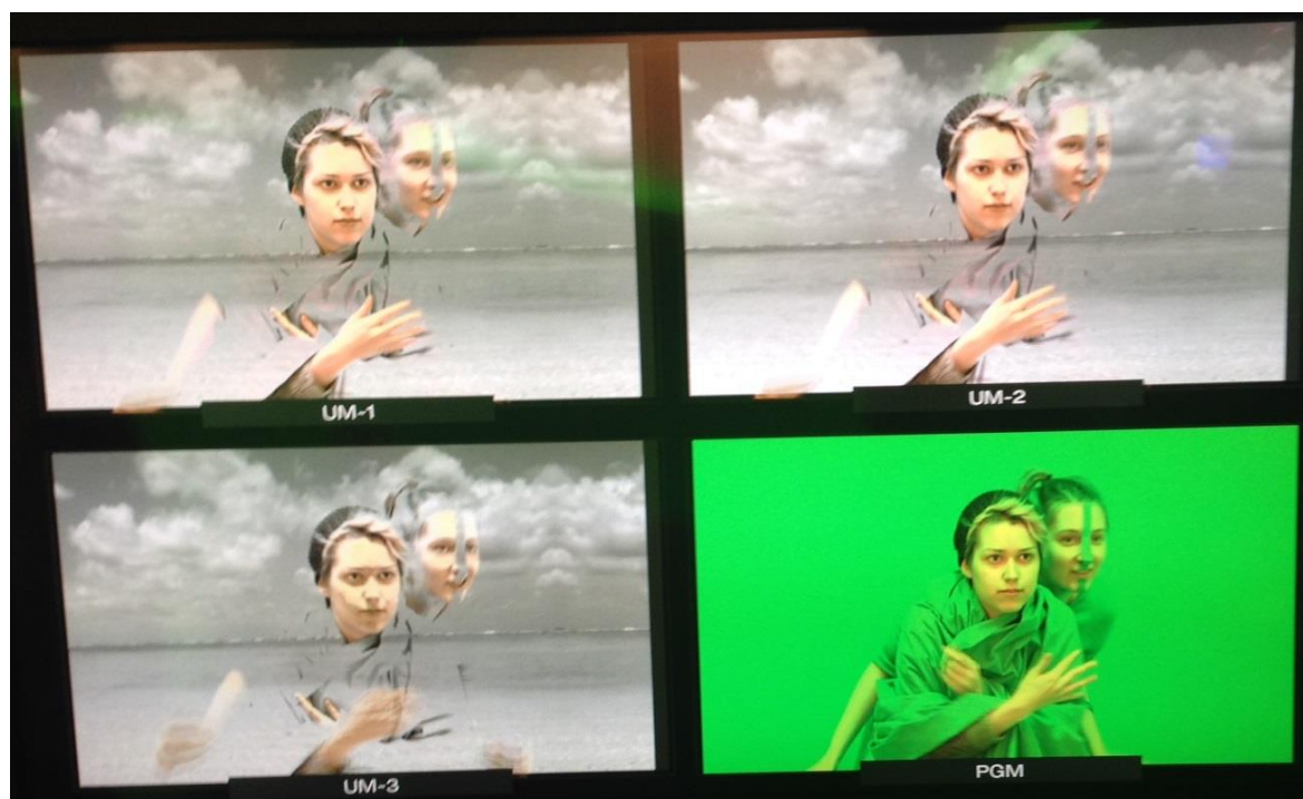
Figure 5: Digital Character Design (2015), workshop conceived and supervised by Sofia Pantouvaki. Experimentation with green screen digital technologies as costume material.

Green screen digital technologies, on the other hand, have been known for several decades, but have been mainly used for the creation of scenography, by adding a digital background on cinematic and televisual applications. Costume designers working in projects involving green screen are customarily constrained to take into consideration the effect of the technology when designing costumes, to avoid the 'dissolving' of the performer's body in the background. What if the body partly disappears?