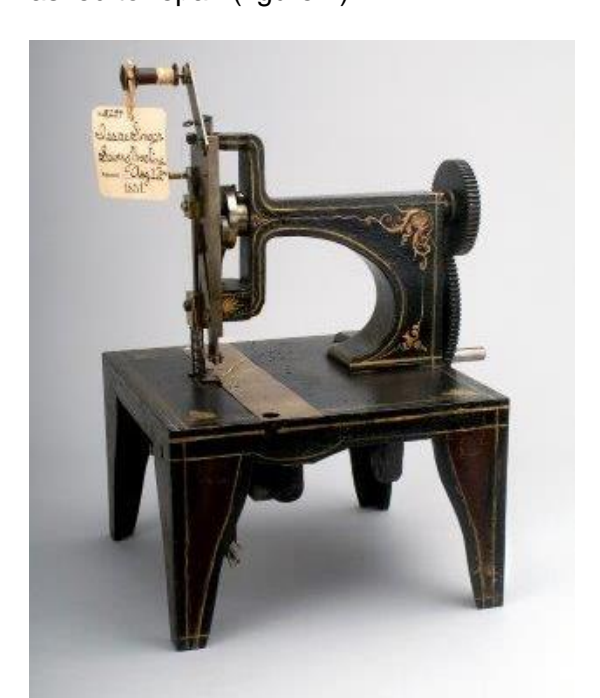
Figure 2: I.S. Singer, Sewing machine, patent model, 1851, Nat. Mus. of American History, Smithsonian Institution, Washington

Sewing by hand is a time-consuming process and American inventor and businessman Isaac Merritt Singer (1811-1875) tried to find a solution. In 1851 he presented his new and improved domestic sewing machine, based on a Lerow and Blodgett sewing machine he was asked to repair (figure 2).