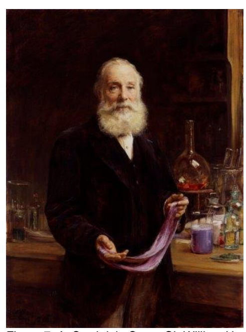
Figure 7: A. Stockdale Cope, Sir William Henry Perkin, 1906, National Portrait Gallery, London, inv. 1892

In this case the coating was deposited on the back dial as well as on one end of the minutes hand using a spray based process, and resulting in the movement appearing to be suspended in mid-air. In 2018 the German brand Powerslide introduced their lace-less performance skate Powerslide V. Vanta Black . Although the name refers to the super-black coating there is no mention of it in the promotional material. Perhaps a case of riding the publicity wave of Surrey NanoSystems ' invention? Besides, the selling price of c. €200 is a clear giveaway. Another example are the black sneakers Foempies® Vanta Black produced and sold by the large Antwerp shoe shop Drie Koningen Shoe established in 1964. Marketed as being 'the fashion must-have', eco-friendly, durable and produced in Europa they retail at only €39,95. A great example of dissemination of innovation, however by name only. Sometimes a new colour is not specially invented but the by-product of other research.