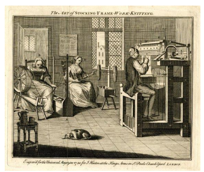
Figure 1: Anon., The Art of Stocking-Frame-Work-Knitting, London 1750, British Museum, inv. Y,4.429

The English clergyman William Lee (1563-1614) from Calverston, near Nottingham is credited with inventing the first knitting machine for stockings in 1589 (figure 1). His intentions were obviously to limit the time needed but initially the experienced knitters were much faster than his new contraption. Besides, the hand knitters were extremely worried that this might cost them their jobs and fiercely resisted the introduction of the knitting machine. At first only used for coarse wool and rejected a patent from Queen Elizabeth I, Lee improved his machine to produce finer silk stockings in 1598. Yet, he was still denied a patent as the Queen was worried about the economic and financial consequences. Thus Lee moved to France where set up the manufacture of stockings in Rouen, under the patronage of King Henry IV who unfortunately was assassinated in 1610. But the knitting frame became a permanent feature and on January 23, 1662 it is recorded in Amsterdam that a certain John Keate bought 'two instruments for knitting silk stockings' and paid the very substantial sums of respectively 300 and 200 Carolus Guilders – around and about the annual wage of a master craftsman.