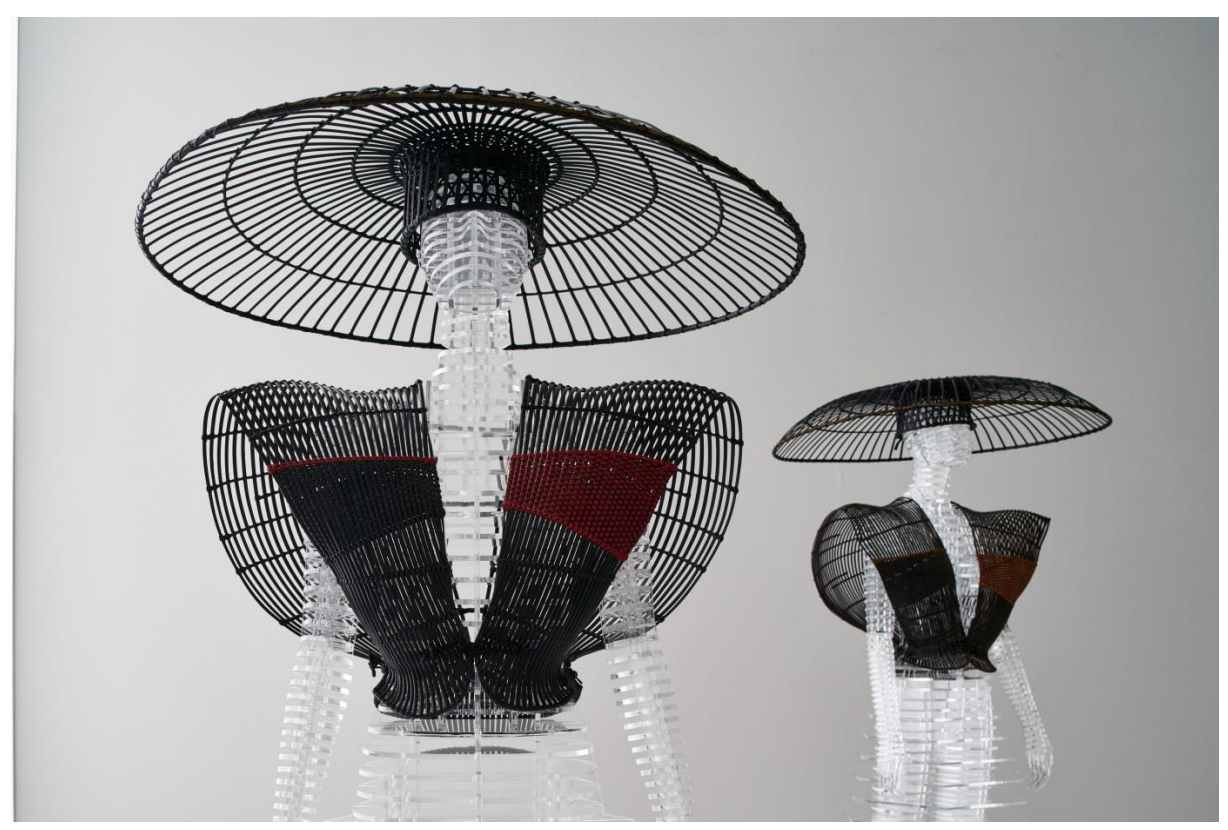
Fig. 10: MIYAKE ISSEY EXHIBITION: The Work of Miyake Issey. Section B. Installation at the NACT.

Miyake developed the "BODY" series at the beginning of 1980s as he continued to think about the form and movement of the body. It is a series of clothing designs using material such as fiber-reinforced plastic, synthetic resins and rattan. The PLASTIC BODY were designs molded on a human form. Issey Miyake's plastic bustier, made in cooperation with a mannequin manufacturer, is the result of the Japanese designer's ongoing exploration of the relationship between clothing and the body (fig. 9). Reversing the idea that clothing clads or conceals the body, the bustier replicates the body – or at least part of one – and then exposes it in a second, plastic skin. RATTAN BODY (1981/SS1982, fig. 10) was made by a traditional craftsman, Kosuge Shochikudo. This piece was chosen as the cover of ARTFORM magazine in 1982. Together with WIRE BODY (1983/AW1983), which are assembled metal wires upon a form to produce a garment that resembled a "body bracelet" and WATERFALL BODY (1984/AW1984) which was made using a partial silicon infusion and the handcrafting techniques behind the "A Piece of Cloth", these sculpture-like clothes are the fruits of Miyake's ever-curious mind and his efforts in support of combining East and West philosophies as well as new technologies and traditional skills.