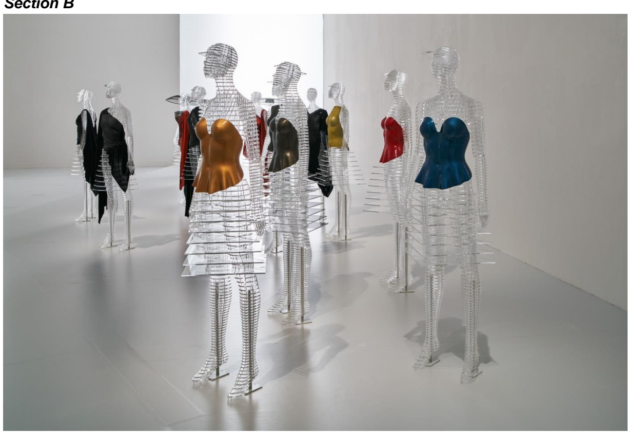
Fig. 9: MIYAKE ISSEY EXHIBITION: The Work of Miyake Issey. Section B. Installation at the NACT.