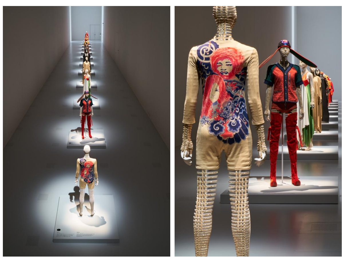
Fig. 7-8: MIYAKE ISSEY EXHIBITION: The Work of Miyake Issey. Section A. Installation at the NACT.