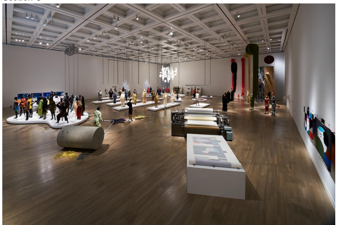
Fig. 11: MIYAKE ISSEY EXHIBITION: The Work of Miyake Issey. Section C. Installation at the NACT.

Section C was the biggest section (fig. 11). The works between the 1980s up to the present day were on display in 5 themed areas: "MATERIALS", "PLEATS", "IKKO TANAKA ISSEY MIYAKE, "A-POC", and "132 5. ISSEY MIYAKE/ INEI".