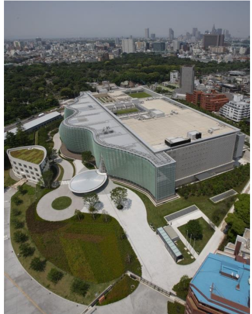
Fig. 1-2: The National Art Center, Tokyo.