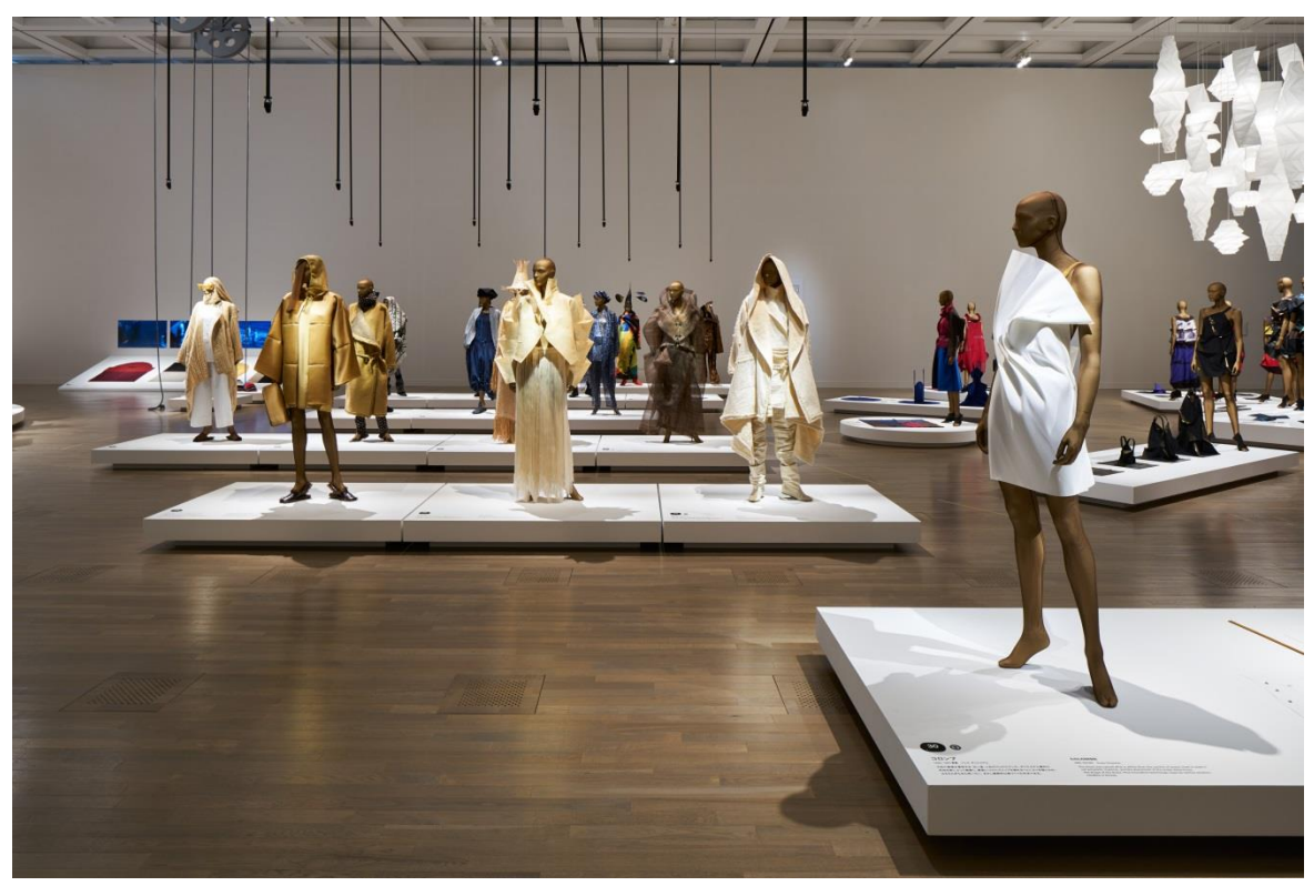
Fig. 12: MIYAKE ISSEY EXHIBITION: The Work of Miyake Issey. Section C. Installation at the NACT.

Section C was the biggest section (fig. 11). The works between the 1980s up to the present day were on display in 5 themed areas: "MATERIALS", "PLEATS", "IKKO TANAKA ISSEY MIYAKE, "A-POC", and "132 5. ISSEY MIYAKE/ INEI".