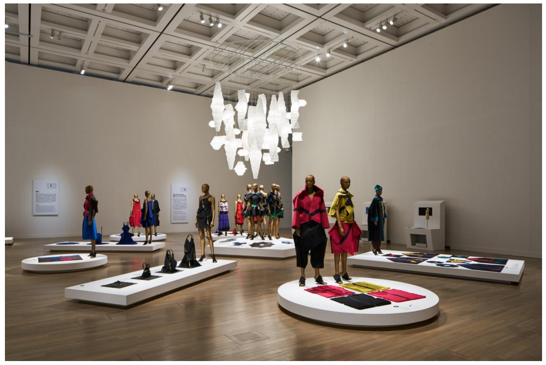
Fig. 15: MIYAKE ISSEY EXHIBITION: The Work of Miyake Issey. Section C. Installation at the NACT.

"A-POC" (fig. 14) was announced in 1998, following PLEATS. A-POC means "a Piece of Cloth" and is also an intentional play-on-words with "epoch." It was developed together with Dai Fujiwara who was creative director of Issey Miyake between 2006 and 2011. All the clothes in the A-POC collection are cut from a single roll of fabric. Form, fabric, texture and the components for finished garments are created in a single process and as a result, A-POC allows apparel to be manufactured with a minimum of waste, and can be applied to both small-lot and mass production.