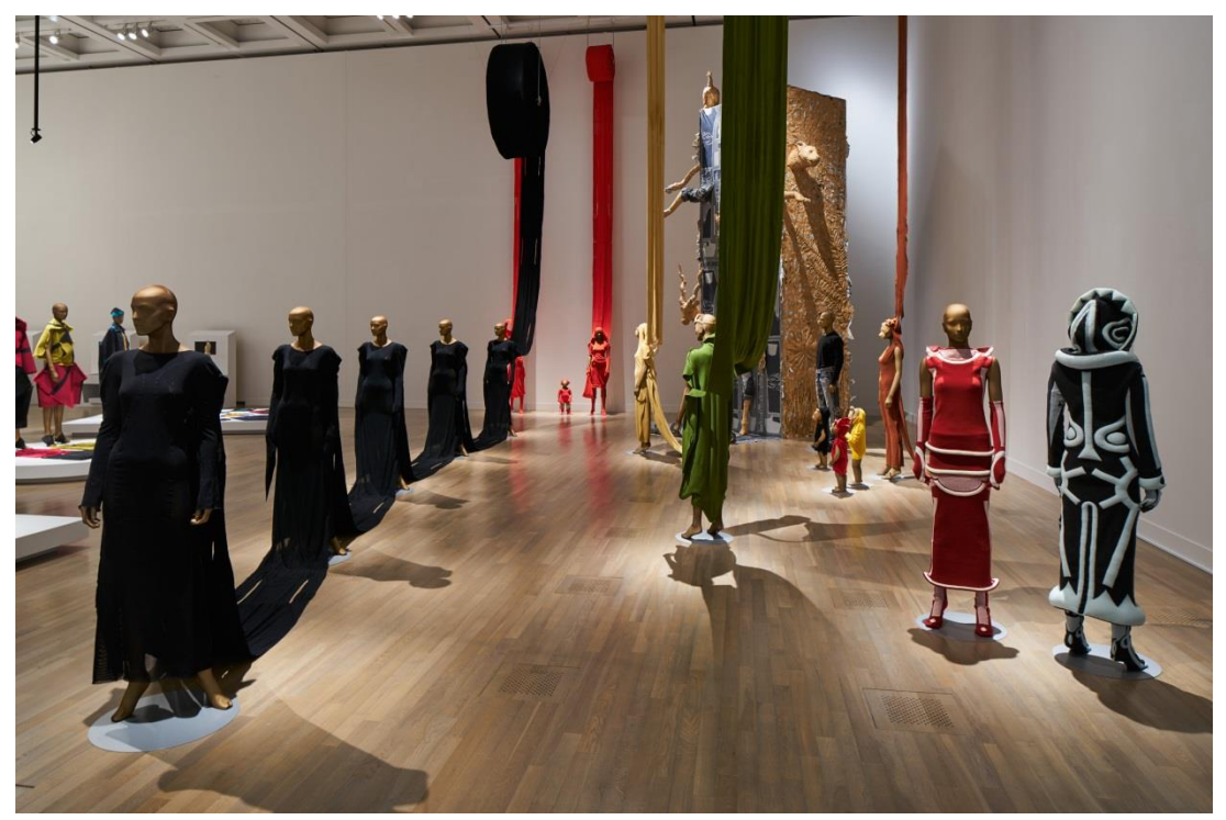
Fig. 14: MIYAKE ISSEY EXHIBITION: The Work of Miyake Issey. Section C. Installation at the NACT.

"A-POC" (fig. 14) was announced in 1998, following PLEATS. A-POC means "a Piece of Cloth" and is also an intentional play-on-words with "epoch." It was developed together with Dai Fujiwara who was creative director of Issey Miyake between 2006 and 2011. All the clothes in the A-POC collection are cut from a single roll of fabric. Form, fabric, texture and the components for finished garments are created in a single process and as a result, A-POC allows apparel to be manufactured with a minimum of waste, and can be applied to both small-lot and mass production.