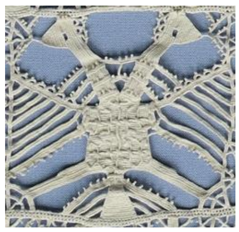
Fig. 4: Wood cut design for lace (detail), Metropolitan Museum of Art (acc. no 21.15.1bis[38]) (Pagano 1554, 19 [verso]) (a). Embroidered lace, Reticella, Venice, late 16th c. (detail). Benaki Museum (inv. no EE3027) (b).

As central subjects in the densely embroidered hems of the Cretan dresses, we can easily recognise flowering vases, which are stylistically similar to corresponding compositions that were very common in the Renaissance repertoire of Italian lace in the sixteenth century, as we mainly find in pattern books for lace and embroidery (for examples see Johnstone 1961, pl. 78 and compare with Abegg 1978, 67, figs. 91, 92, 94). What is interesting, however, is the dissemination of certain specific subjects, which also correspond to Italian lace through which, apparently, they spread to Cretan embroidery: the double-headed eagle (fig. 2, 4) and the mermaid or siren with a forked tail (fig. 2, 5). We will focus more on this last subject, which was transferred from medieval manuscripts illustrated with animals and monsters to pattern books for embroidery and lace printed in Venice in the sixteenth century.