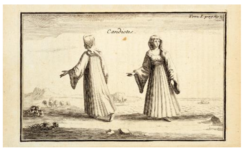
Fig. 8: Pitton de Tournefort, Women of Candia , engraving, 1718. Benaki Museum (inv. no 40776).

of reddish cloth, full of pleats, hung on the shoulders by a couple of thread-laces" (Johnstone 1972, 29), a description that might fit the drawing but not so much our dress, unless we assume, like Pauline Johnstone, that the embroidered dresses that are preserved in museum collections are bridal or festive variations of the monochrome reddish dress described by Tournefort (Johnstone 1972, 29).