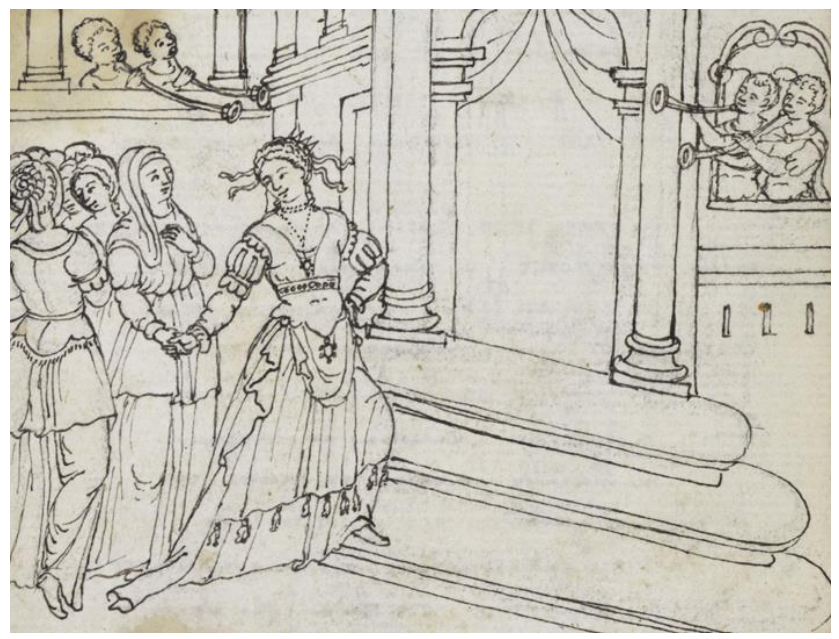
Fig. 10: Illustration of the 1710 Erotokritos manuscript, representing Aretoussa, the main female character, with her outer dress gathered up. British Library, Harley MS 5644.

in the 17<sup>th</sup> century, probably pleated, made of red felt or even of a more precious fabric, which would be probably gathered up in various occasions (Fragaki 1960, 48-9, Macha 2009, 257). The use of this garment, quite close to the reddish dress described one century later by Tournefort, as noted by Macha, is confirmed by the existence, in more recent years, of various types of red skirt (fig. 9), which the two scholars consider to be its survival.