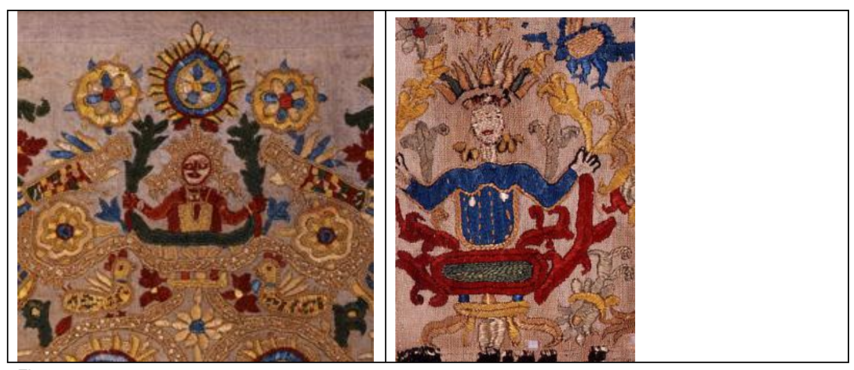
Fig. 6: Dress borders, silk embroidery on cotton & linen (details). Crete, late 17th-early 18th c. Benaki Museum (inv. nos EE3389 [a] & 26111-gift of Maria Matzouni [b]).

This subject seems to have particularly impressed the embroiderers of Crete, since we find it in many variations. The figure usually wears a crown (fig. 2, 6b, 7) and is sometimes assimilated into the surrounding foliage (fig, 6, Zora 1960, 348-9), while, according to some scholars (Wace 1935, 33), she is very often transformed into the figure of a woman, dressed in a simple peasant costume, the only vestige of her previous existence being the gesture of her outspread, raised hands, which no longer hold the edges of a double tail, but two blooming branches (fig. 7).