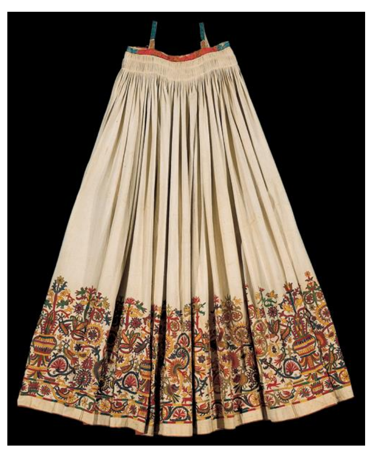
Fig. 1: Dress, linen & cotton, with silk embroidery. Crete, 17th-18th c. Benaki Museum (inv. no EE872), gift of George II.