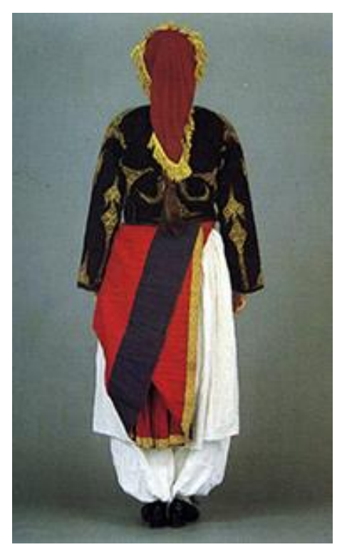
Fig. 9: Early 20<sup>th</sup>-c. postcard representing an old woman with the Kritsa costume, including a kouda skirt gathered up (a). Female costume, with a sartza skirt gathered up in the back. Anogheia, Central Crete, late 19th c. (b) Peloponnesian Folklore Foundation.

In the attempt to reconstitute the lost ensemble, of which the pleated dress of the seventeenth to eighteenth century is a part, some theories have already been proposed. It is worth looking at Evagelia Fragaki's theory which has also been reformulated by Nantia Macha. The two scholars take as a starting point the "karpeta", a dress or skirt worn in the Cretan countryside