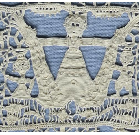
Fig. 5: Wood cut design for lace (detail), Metropolitan Museum of Art (acc. no 29.5.91bis[27]) (Pagano 1556, 14 [recto]) (a). Embroidered lace, reticella, Venice, late 16th c. (detail). Benaki Museum (inv. no EE3027) (b).