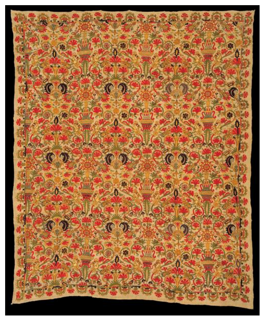
Fig. 3: Bedspread, silk embroidery on linen & cotton. Crete, late 17th-early 18th c. Benaki Museum (inv. no 32646), gift of Christopher Tower.

Details about the standard of living of this new Cretan class are available to us through notarial documents of the time – wills and dowry agreements – that record the imported luxury goods to which the bourgeoisie and the aristocrats of the Cretan cities had access (Mertzios 1961-62, 228-308). Out of these, we will focus on references to imported fabrics such as satin, velvet or damask, or even entire garments (Macha 2009, 254; Maltezou 1986, 139-47). Samples of these fabrics have not survived in museum or private collections. However, a rare embroidery with a dense, repetitive pattern of motifs throughout the fabric, which is preserved in the Benaki Museum (Delivorrias and Georgoula 2005, 166), seems an attempt to copy some precious silk cloth, whose production would not have been possible in Crete (fig 3)