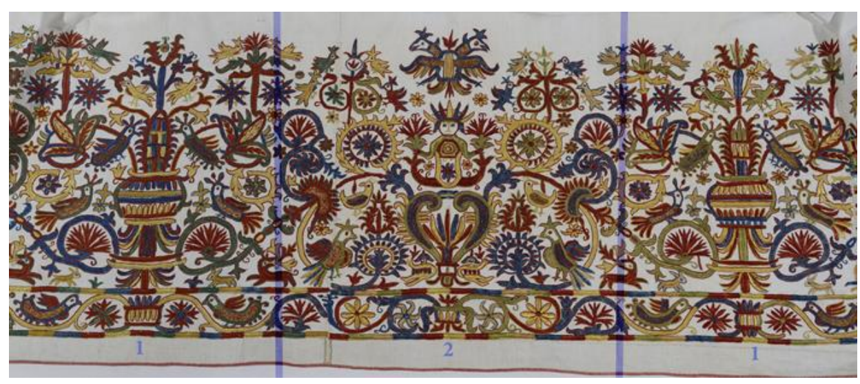
Fig. 2: Detail of the EE872 dress border.

There is no space here for a detailed description of the dress. We will only say that it is made of a white linen-cotton cloth in a tabby weave with a hem richly embroidered in silk thread in a horizontal band 45cm high, with two elaborate compositions that are repeated throughout: one with a flowering vase as the central subject and another with a fork-tailed mermaid (fig. 2).