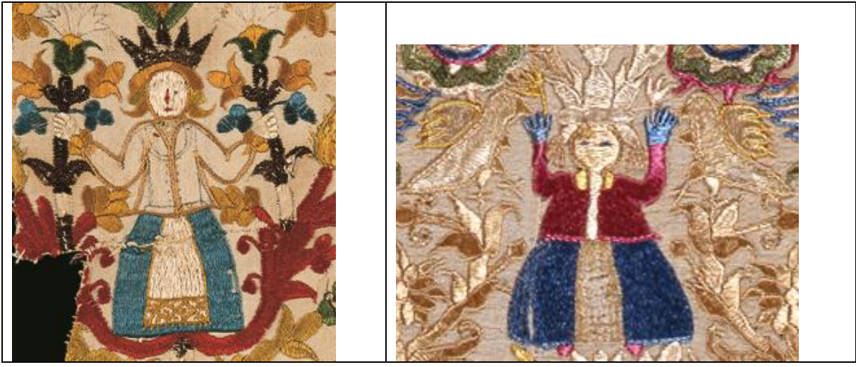
Fig. 7: Dress borders, silk embroidery on cotton & linen (details). Crete, late 17th-early 18th c. Benaki Museum (inv. no 26110-gift of Maria Matzouni [a] & EE1564 [b]).

This subject seems to have particularly impressed the embroiderers of Crete, since we find it in many variations. The figure usually wears a crown (fig. 2, 6b, 7) and is sometimes assimilated into the surrounding foliage (fig, 6, Zora 1960, 348-9), while, according to some scholars (Wace 1935, 33), she is very often transformed into the figure of a woman, dressed in a simple peasant costume, the only vestige of her previous existence being the gesture of her outspread, raised hands, which no longer hold the edges of a double tail, but two blooming branches (fig. 7).