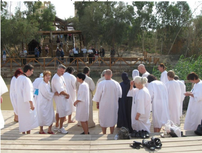
Fig. 4: Baptism today at the Jordan River.

The existence of the monastery and a church is mentioned in sources from the eighth and ninth centuries AD. In the crusade period (12th-13th centuries CE), the number of pilgrims to the area increased. One source mentions that in 1172 about 60,000 pilgrims visited the Baptism site (Gal 2011, 12). Today ceremonies attended by thousands of people are performed (Gal 2011, 15) (fig. 4).