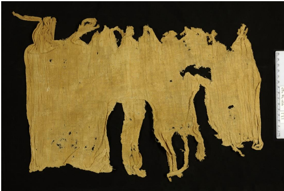
Fig. 7: No. 13.1, Cotton textile with selvedge to selvedge (loom width) preserved. Qasr el-Yahud.