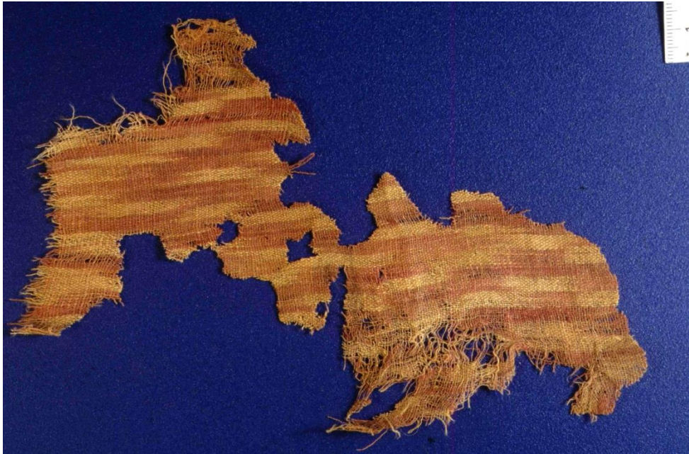
Fig. 2: A fragments of the cotton warp Ikats found at Nahal 'Omer.

We studied and catalogued 251 textile fragments. Many of the discarded cut and torn pieces appear originally to have come from garments. The composition of the Nahal 'Omer assemblage is remarkable for its high proportion of cotton textiles – 153 out of 251, as cotton is rarely found in this period. Three textiles are made of silk, the only silk textiles discovered in the Land of Israel during this period. The other textiles are made of wool or linen.