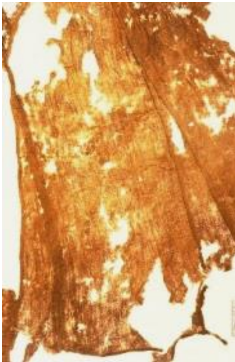
Fig. 8: Cut-to-shape tunic. Qasr el-Yahud.

The use of the textiles is varied including tunics, head coverings, bandages and shrouds. 25 tunics were found at Qasr el-Yahud (fig. 8). They were cut to shape. The sleeves, if any, are made from separate pieces. Some tunics have a binding at the bottom, usually of 3 cm in width. It was used in order to reduce the wear at the bottom of the tunic. Cut-to-shape tunics can be divided into two groups according to their cut, namely straight tunics cut and sewn to form a cylindrical tube of cloth, and gored tunics forming a cone shape. Triangular gores were used in the lower parts of the side seams, each gore usually composed of two triangular panels of the same cloth as the ground weave. The sleeves, if any, were made from separate pieces (Linscheid 2001, 76). Few tunics have a gusset resembling finds from Kulubnarti in Nubia, 600 to 850 CE, where square gussets reinforced the underarm area of the sleeves al-