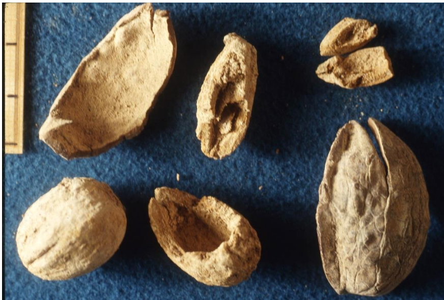
Fig. 5: Egyptian Balsam ( Balānites Aegyptiaca) seeds which were found in the hands of the deceased and a walnut shell placed on the thorax of one of the deceased. Qasr el-Yahud.