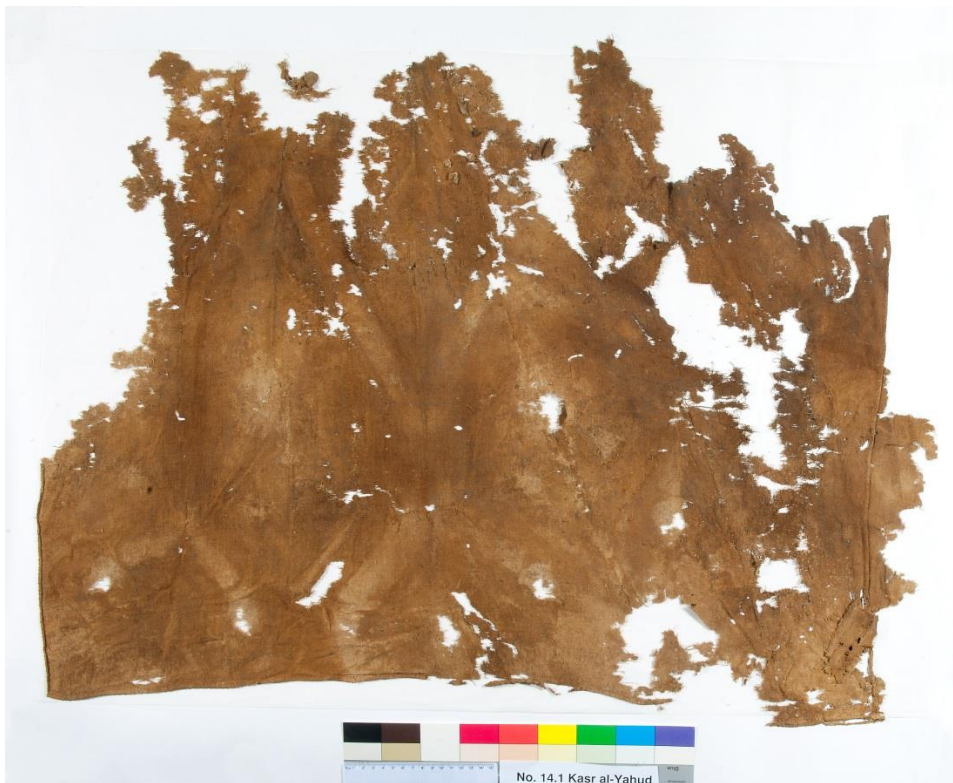
Fig. 9: No. 14.1, Shroud.

low greater freedom of movement (Adams 1999:55). They were also found at the Jeziret Fara'un (Coral Island) from the late twelfth and thirteenth centuries CE. The classical Mediterranean tradition of weaving clothes to shape lingered on in Egypt until well after the Arab invasion (Granger-Taylor 1982, 22). It became more common following the Arab expansion and within two hundred years it became predominant (Granger-Taylor 1983).