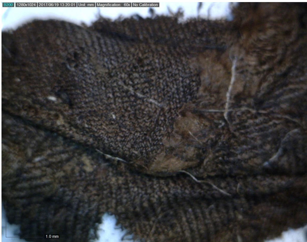
Fig. 10: Caesarea silk textile.

(No. 2007-9011) were of several layers, one on top of the other, in very poor condition – partly carbonated and very fragile. It is assumed that they are fragments of the coffin lining and of the shrouds and/or vestments of the deceased. There are two fragments of a silk tablet woven band, brocaded with a gilded membrane lamella wound on a silk core.