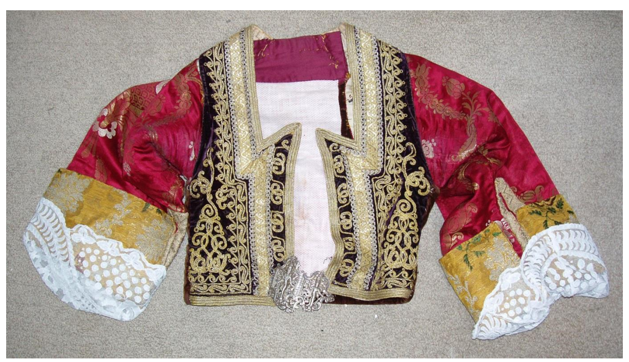
Fig. 5: Wedding jacket from Dobrota.

Parts of a traditional wedding ensemble, worn in 1849 by Ana Andrić from the town of Dobrota, are presently kept in the Maritime Museum of Montenegro in Kotor (Vukmanović 1953, 227; Vujošević et al. 2003, 92). A jacket – kamižola (Ital. camiciola ) – belonging to the ensemble was made of red and yellow eighteenth-century Venetian silk damask with golden and silver floral motifs (fig. 5).