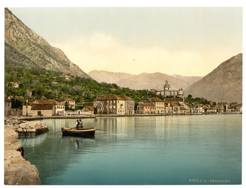
Fig. 2: View of the late 19<sup>th</sup>-century Prčanj with the unfinished new parish church.

parish church of the Nativity of the Blessed Virgin Mary holds a large number of votive offerings, including the refashioned wedding dresses of local brides.