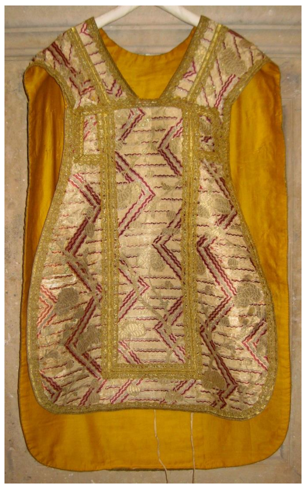
Fig. 6: Chasuble made from the Verona wedding clothes.

A chasuble with a preserved matching stole, maniple, and burse was made from the clothes offered by a bride from the Verona family (fig. 6). The fabric, dated to the mid-eighteenth century, is white, Venetian silk brocade, with a pattern of gold, long-petaled flowers, arranged over a grid of vertical zigzag and wavy horizontal stripes in purple, pink and silver (Radojković 1964, 260; Luković 1965, 74).