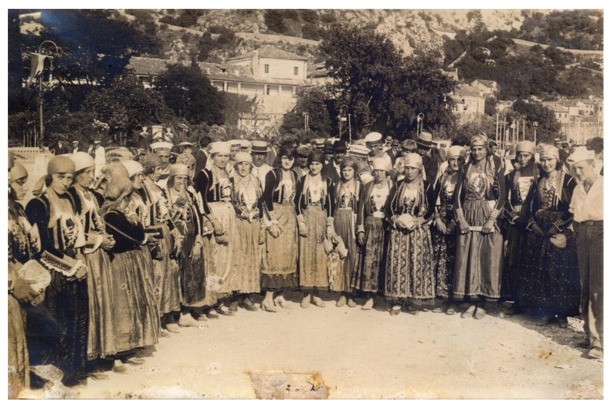
Fig. 4: Women from Boka in traditional dress, Kotor, 1930.

The life and culture in the Bay of Kotor and the rest of the coast developed in a Mediterranean climate and economic conditions. A developed maritime economy, the closeness of a continental hinterland, and the centuries-long presence of two powers, Venice at sea, and the Ottoman Empire in the continental area, resulted in diverse influences that intertwined in the area and were reflected in dress shapes and names, as well as the types of materials (Bjeladinović 2011, 127).