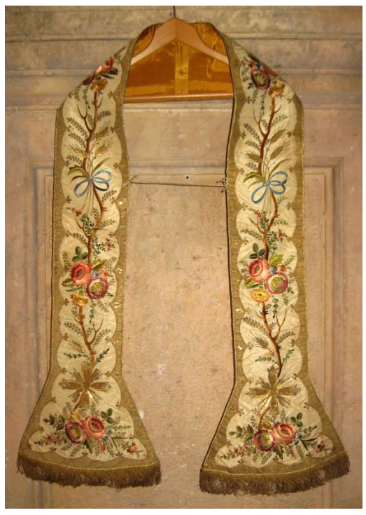
Fig. 3: Stole made by the Florio bride.

The early modern society of Boka constructed an ideal image of a devoted and pious maritime woman whose life was marked by a long waiting for her man to return from the sea. In 2016, the legend of three sisters from Prčanj (Tre Sorelle) was declared as intangible cultural heritage of local importance. According to a version of the legend, they all were in love with the same seaman and they eventually got old and died one by one, waiting in vain for his return. The legend is associated with an abandoned house in Prčanj, built in the fifteenth century, where they supposedly lived and which consists of three nearly identical interconnected ranges that have separate roofs.