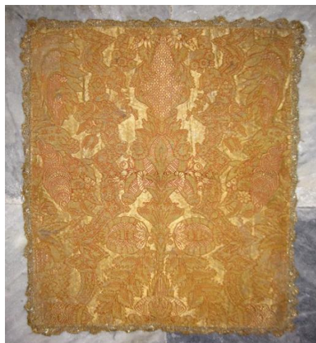
Fig. 8: Dalmatic and chalice veil made from the Zerman wedding clothes.

The quality and quantity of fabric obtained from the Zerman wedding clothes suggest that it might have originally been a rococo dress of the robe volante or robe à la française type. The eighteenth-century dowry inventories of Italian settlers in Venetian Boka occasionally listed sumptuous rococo dresses under the Italian name andrienne (Radojičić 2009, 249).