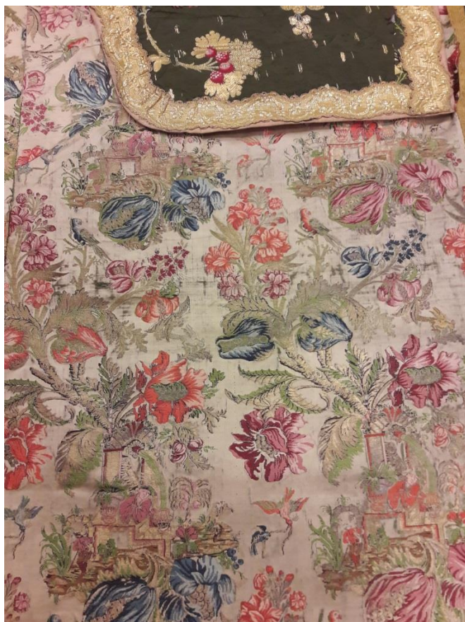
Fig. 10 Cope (fragment). Fabrics from Lyon, ca. 1735–1740 / Cope sewn in Poland. Inv. No MNK XIX-8262. Purchased 1971.

ment. The large surface of the cope is composed of many pieces of fabric. Their shape indicates that they came probably from a skirt. Nevertheless the overall effect is quite pleasing.