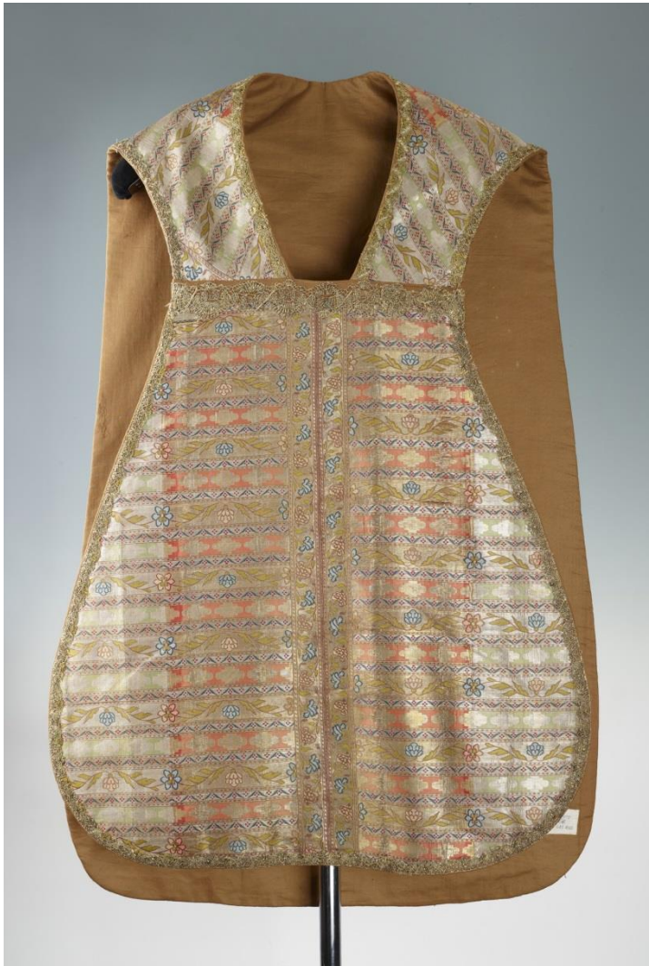
Fig. 4: Chasuble made of kontush sashes, circa 1800. Inv. no. MNK XIX-4666. Given by Feliks Jasioński, 1929.

along the edges. The most decorative part of a sash are its endings, called “heads”, usually with floral ornament inspired by Persian textiles. The Polish sash is double-sided. The most valuable sashes are “four-sided” (fig. 3), i.e. the background of both sides is divided into two colour zones, which allowed the nobleman to wear his folded-in-half sash in four different colour versions. As the surface of a chasuble is divided into three parts: orphrey band and two sides – it was very easy to sustain such a composition using only one kontush sash.