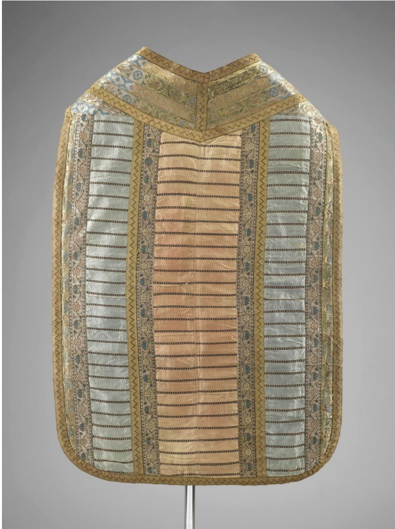
Fig. 5: Chasuble made of kontush sashes, ca. 1800. Inv. no. MNK XIX-4667. Purchased 1914.

The third chasuble, also made out of Sluck sashes, has no lining. Apparently it was a double-sided cheap solution for a poor parish church. Usually double-sided sashes had one side in bright colours and one with predominance of black, used during mourning. A maker of the chasuble utilized this feature and created the gold and silver vestment for the greatest church feasts and the black one for funeral celebrations. Golden braid trimmings on both sides of the chasuble prove that we have to do with a double-faced vestment, not with a vestment lacking its lining. This time the „heads” of the sash were used for additional decoration of the lower part of the chasuble.