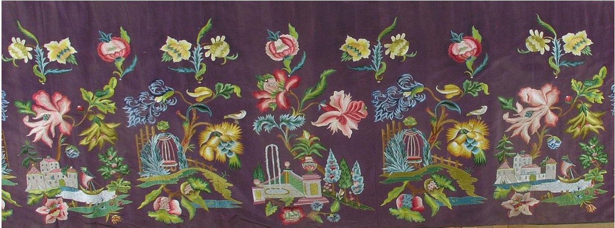
Fig. 8: Fragment of a skirt, which belonged to Princess Maria Zofia Czartoryska, de domo Sieniawska, Poland, ca. 1735-1750. Inv no MNK XIII-2813.