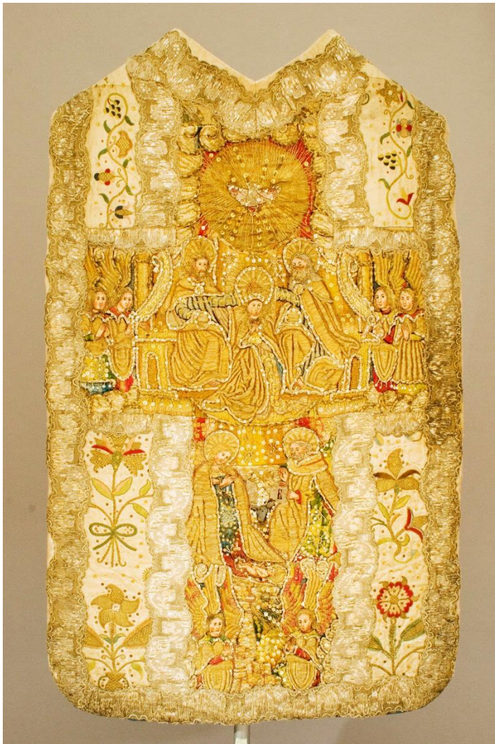
Fig. 6: Chasuble, Poland, 18th c. Inv. no. MNK XIX-367. Unknown provenance.

The white chasuble for the St. Mary fetes looks quite impressive, with an orphrey band embellished with scenes of St. Mary's Coronation and Christmas (Inv. no MNK XIX-367; fig. 6). The embroidery is very shiny, executed with silk yarn, golden thread, golden bullion and golden and silver sequins. Faces of peoples and angels are painted. The edges and seams of the vestment are trimmed with silver lace. At first glance the chasuble seems to be a donation of a very wealthy donor. When we look closer we can see that the embroidery is naïve in style and not of a high artistic quality. The sides were probably made from a women's skirt: the fabric is decorated with embroidery typical for early eighteenth-century dresses: flowers on long stems are shown in the field adorned with little silver sequins. The pattern doesn't suit the cut of the chasuble well and it is partly obscured with opulent silver lace. In this vestment we can observe a combination of naïve style and "recycled" materials together with an effort to create an impression of richness and splendour (Taszycka unpublished, cat. 94).