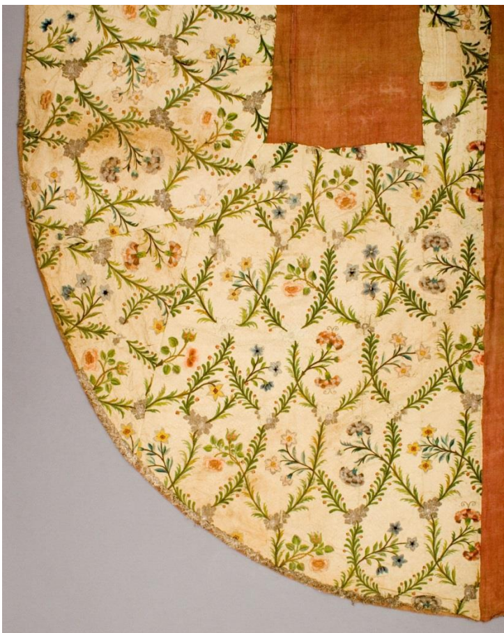
Fig. 9: Cope front made of embroidered skirt, Poland, ca. 1765 – 1770. Inv. no. MNK XIX-361. Unknown provenance.

Copes made of secular outfits are very interesting to examine because of their big size. They are usually circa 3m wide and 1.3m high. To make a cope one needed a lot of fabric. We can presume that almost an entire skirt had to be used to sew one cope.