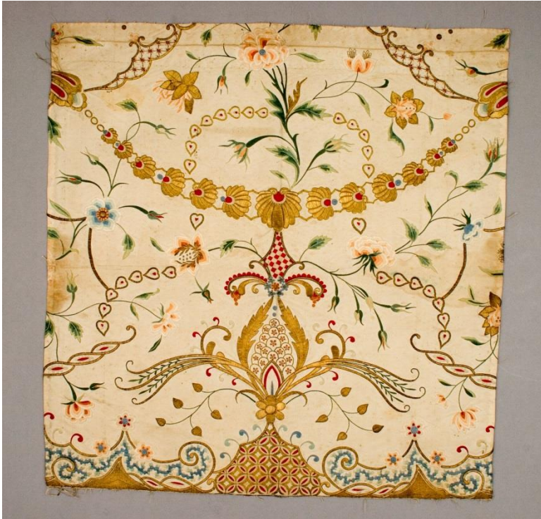
Fig. 11: Chalice veil, China for European market, ca. 1745. Inv. no. MNK XIX-108. Purchased 1905.

dress was commissioned in China by the bride's guardian, Jacob Roman, probably two or three years before the wedding in 1747 (Meij 2005, 140-9, 222). When we compare the embroidered fabric from our collections with white mantua from the Hague museum we can say that analogically it had to be placed on the central axis of a skirt.