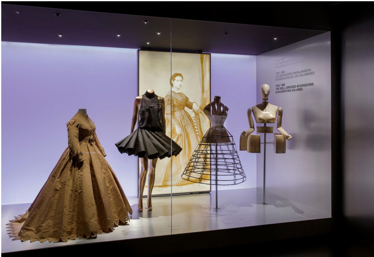
Fig. 8: Four characters in the '1845-1868. The Well-dressed Bourgeoisie. Exaggerating volumes' display case.