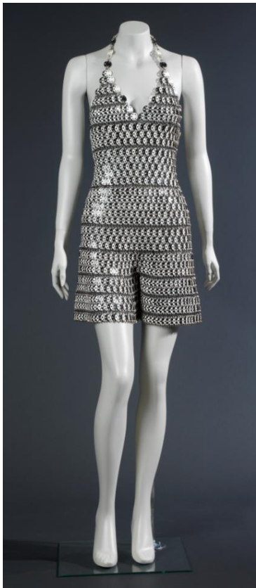
Fig. 5: Action of revealing. Short jump suit, Paco Rabanne, Paris, 1966, Plastic, rings of steel and aluminium, MTIB 109628, donated by Paco Rabanne.