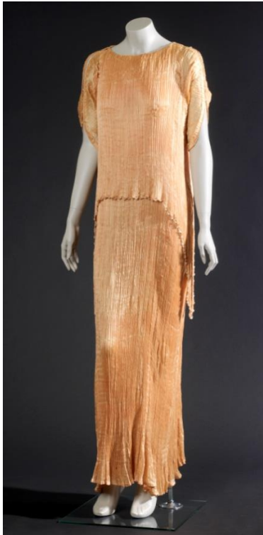
Fig. 4: Action of profiling. Delphos tunic dress by Mariano Fortuny, Venice, 1909, silk pleated taffeta and Murano glass beads, MTIB 3225/07.

Profiling means clinging to the forms of the body without modifying them (fig. 4). Examples of items of clothing that do this include tights, gloves, body stockings and T-shirts.