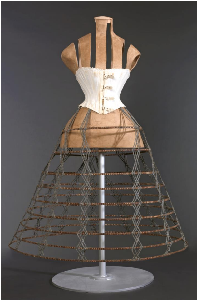
Fig. 6: Interior structures give volume to the body or compress it. Corset, Spain, 1850-60, cotton cannelé, MTIB 4139/13. Crinoline, Catalonia, 1860-62, cotton tape and braid, metal sheet, MTIB 4140/13, donated by Manuel Rocamora.

The seamstress, tailor, creator and the fashion designer use three means associated with their craft to carry out these five actions. The first of these is their chosen fabric: a flexible material, such as knitted silk, adapts to the shape of the human anatomy, whereas a stiff fabric, such as velvet or faille, isolates the item of clothing from the body. Then there are the cutting and tailoring techniques they use. The way the fabric is arranged on the body is important: cutting it on the grainline or the bias affects the way it hangs; and the points that support it (shoulders, waist or hips) will determine whether the item of clothing billows or clings. The pattern employed plays a part, as the use of darts will make the garment close-fitting, whereas pleats, gathers and layers of fabric will increase the volume of its silhouette. Additions such as trimmings and lace will also affect the final look.