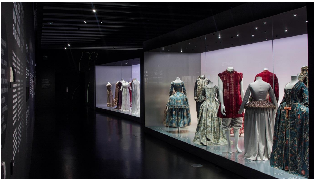
Fig. 7: A conceptual itinerary faces the authentic costumes in the exhibition Dressing the Body, Silhouettes and Fashion, 1550-2015.