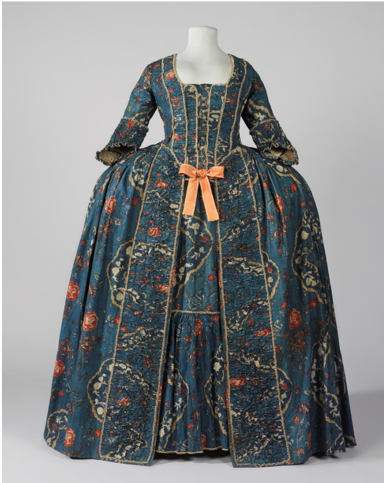
Fig. 1: Action of increasing. Court gown, France, ca. 1760, printed cotton taffeta, MTIB 88015, donated by Manuel Rocamora.

There are five actions carried out by clothing on the body that we regard as being particularly important. These are increasing, reducing, elongating, profiling and revealing.