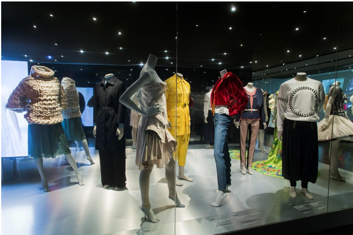
Fig. 11: Contemporary fashion.

The ideals of beauty, femininity and masculinity that we have embraced in our lives force us to expend considerable effort in relation to our bodies, an ongoing and never-ending effort to remain slim, muscular and healthy. We have to remain vigilant, constantly monitoring ourselves and others. Now that fashion is global and uniform, people stand out not just by the way they dress but also by altering their skin and their body shape. Society 'invites' us to follow restrictive diets, to use creams and cosmetics to sustain our skin, to do exercise on a continual basis, all of which is big business for professionals such as doctors, dieticians and personal trainers and the treatment centres and companies operating in the beauty industry. 'Aesthetic' surgery offers ever younger body shapes in the likeness of body image leaders, athletes, actors and actresses, singers and models. Extreme diets are financially and physically very demanding, and we need to establish a balance between effort and outcome. Such serious modifications, which change as the individual ages, are themselves subject to revision and transformation like fashion itself. Our freedom to choose is reduced, since social pressure forces us to go with the herd, to adopt the adequate, the trend in beauty of the time, especially now, when the media dominate everything.