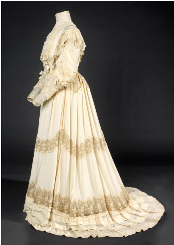
Fig. 3: Action of elongating. Wedding dress by Caroline Montagne, Barcelona, 1905-07, silk crepe and gauze, MTIB 88114, donated by Manuel Rocamora.

The action of elongating (fig. 3) consists in seeking to lengthen the silhouette to make the person seem taller and more stylized, an effect most commonly achieved by means of high-heel and platform shoes, hats and dresses with long trains.