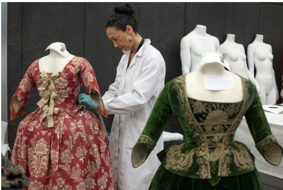
Fig. 10: Adapting mannequins.

Each mannequin has to be adapted to create and shape the specific body required for each garment (fig. 10). Using materials that will not cause damage, volumes are added to the mannequin by filling in those areas needed to give it the exact form to support the clothing. The garments are placed on the mannequin, their original form untouched and unmodified by tucks or pins. The mannequin, the artificial body, provides the support for the item of clothing, which rests on it without any tension, thereby ensuring the proper conservation of the garments.