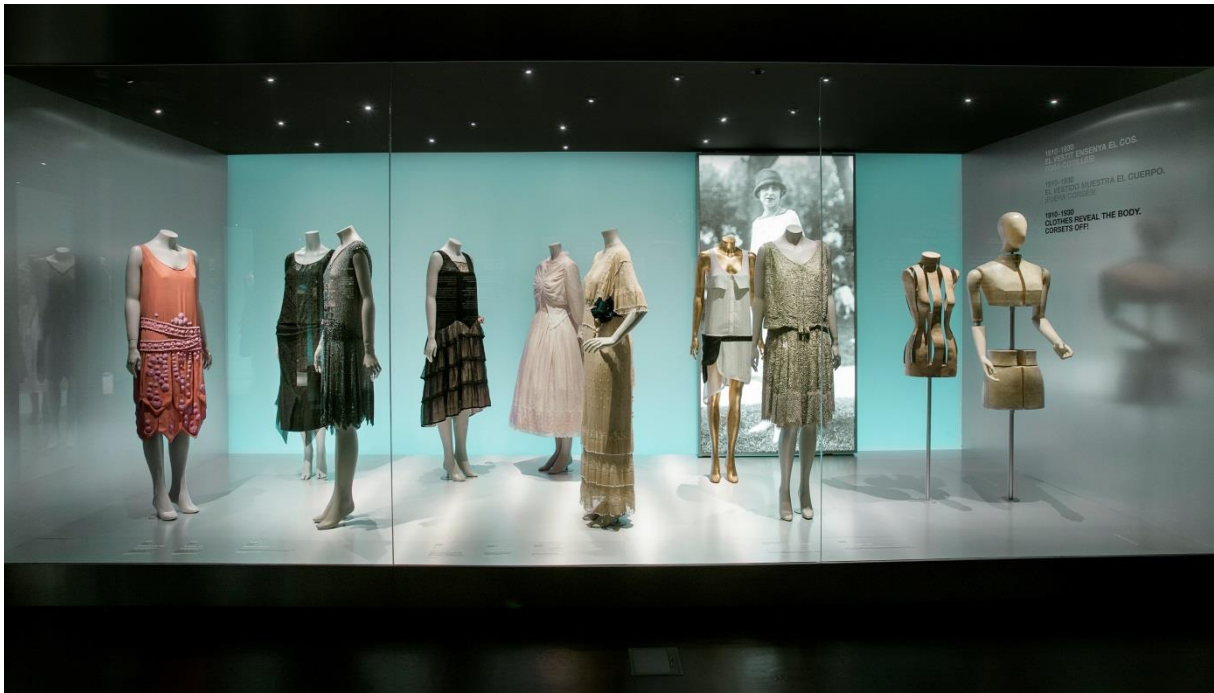
Fig. 9: The '1910-1930. Clothes Reveal the Body. Corsets off!' display case.

Two large wall display cases contain the interior structures (corsets, bustles and bras) in a deliberately more abstract and static arrangement than the main garments, while cylindrical vitrines made of methacrylate house hoops for skirts.