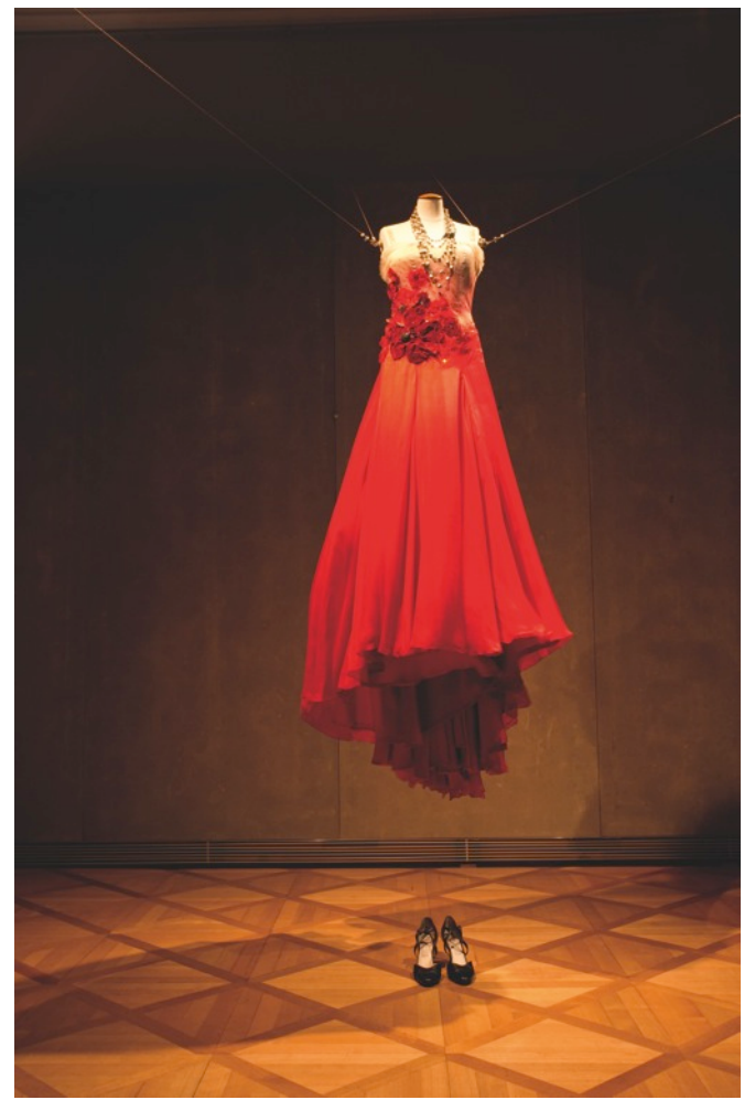
Figure 4: Brigitte Hobmeier's Dress, 2014

We decided to hang one of the costumes at the end of the picture gallery- like an appetizer to make the visitor curious about visiting the Northern Oratory.