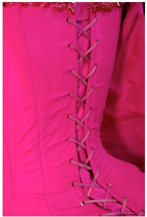
Figure 3: Detail of Sunnyi Melles' costume, 1990

We contacted the Salzburg Festival Archives to look at the designs and photographs of the various productions. We studied the programme booklets issued for the performances. I collected the documentation depicting the creation of the dresses in the Festival's ladies' tailorshop, giving references to the different silk fabrics, describing even the colour of the threads. We contacted the local television channel to provide us with all the evening reports of the different stagings. We established the timetable, including dates and decisions for publications and press release. Anneliese Kaar, the Graphic Designer took detailed photographs of the dresses.