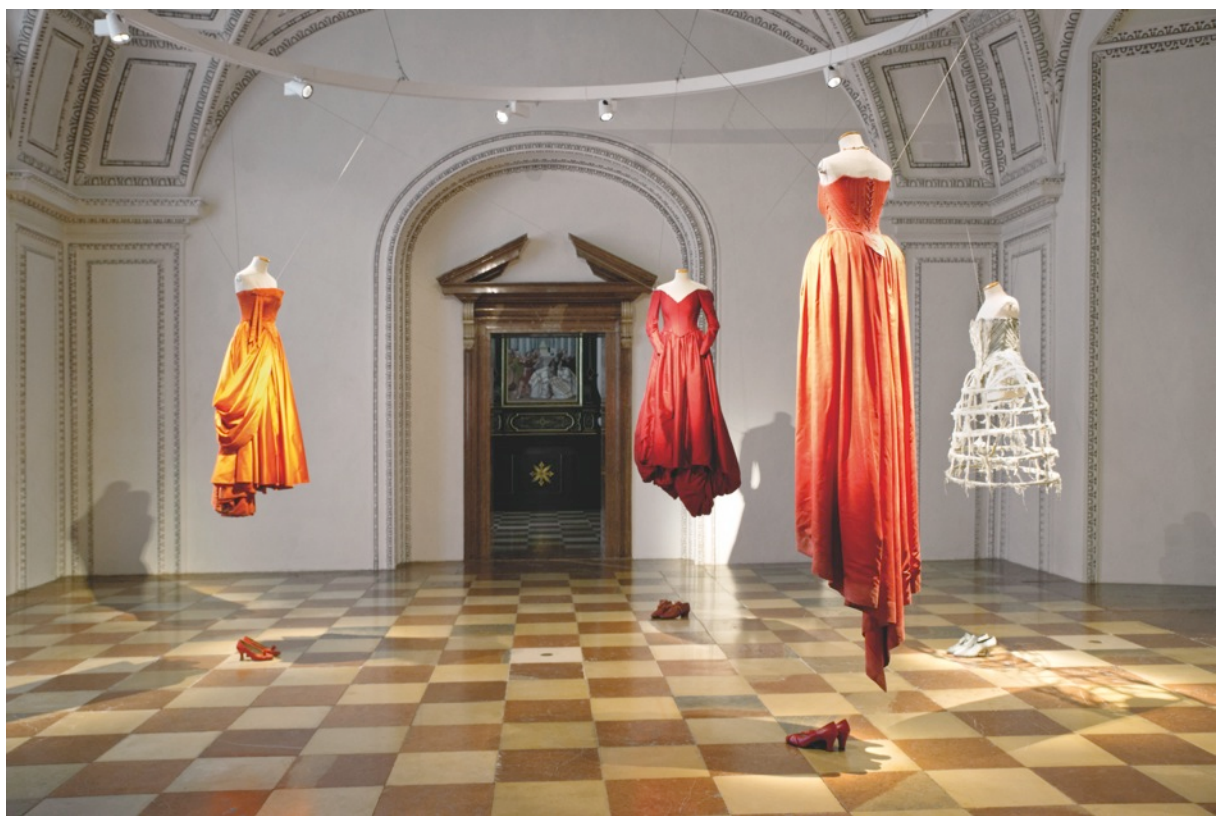
Figure 5: Northern Oratory, third room

Brigitte Hobmeier's 2014 dress could be seen through the whole axis of the gallery, inviting the visitors to come close. A hidden wind machine made the ample skirt of silk satin and silk mousseline slowly dance in the air. The theatre light projectors made the rhinestones of the bodice glitter.