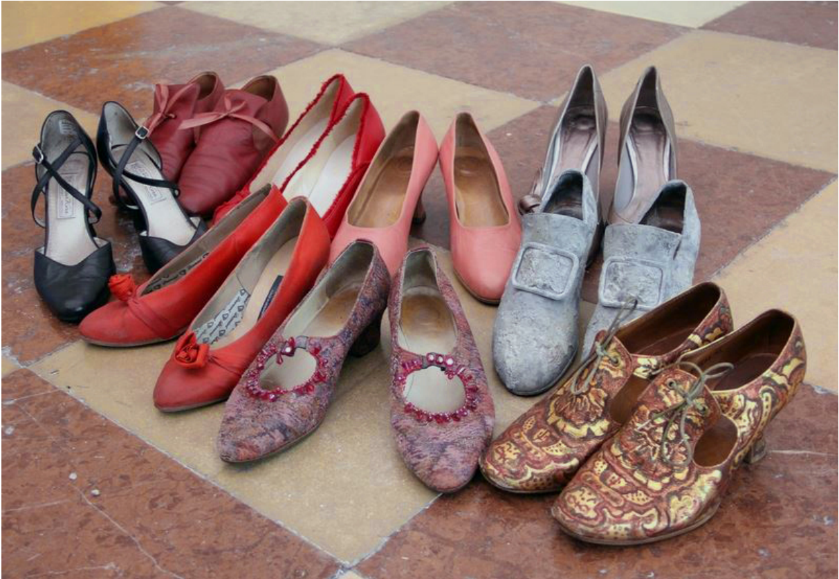
Figure 7: The Paramour's Shoes

In times of budget limitation sometimes the synergy of different institutions in the same city allows new aspects of objects and places that always have been there to be explored. We did not need to rent or tansport anything, we just carried it next door. The costumes were hanging in the Salzburg Festival stock in the dark and have not seen public light since they performed on stage. With this exhibition visitors and many residents of Salzburg, enjoyed meeting their Paramours again, and with the chance to compare them. Normally a Paramour is the only one on stage, but in this exhibition they met for the first time like friends.