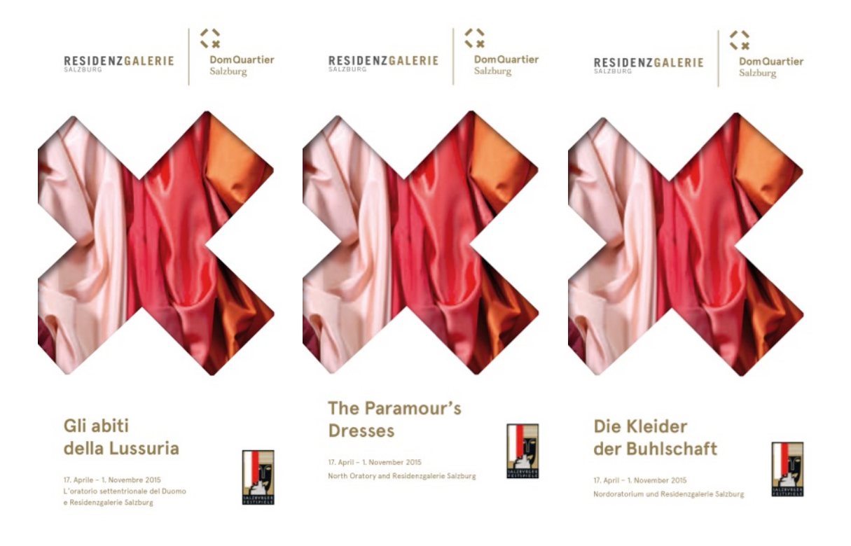
Figure 6: Booklets in Italian, English, German

The motif of the booklet was designed following the Domquartier's corporate identity guidelines and was also used for a poster, seen all over the town of Salzburg.