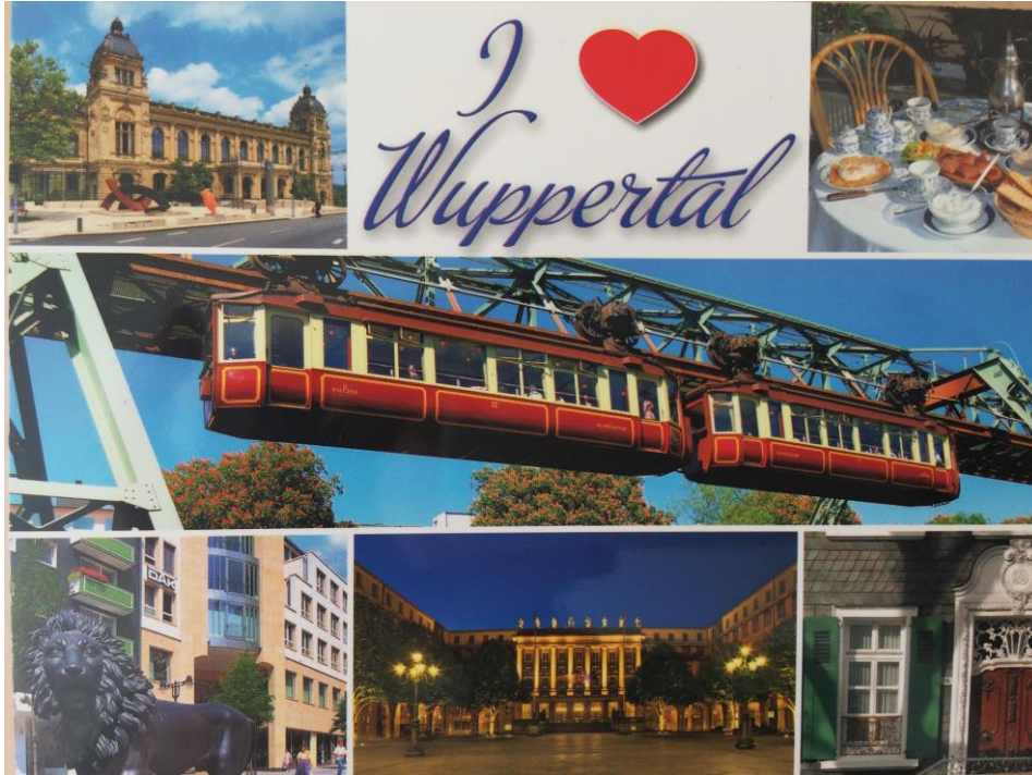
Fig. 1: Old Wuppertal postcard, probably early 1970s.

Dorothea Nicolai Costume and Set Designer, Zurich, Switzerland