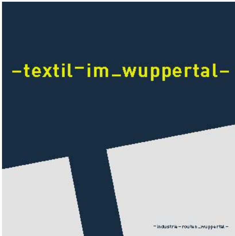
Fig. 4: Logo textil im Wuppertal © Bergischer Geschichtsverein.

open garments was more than a brand: it was the magic of a new era. Only here in Wuppertal he found the technical skills to develop the necessary machines. In 1925 already 10,000 metres of Riri were produced daily. In 1936, opposing the Nazi regulations he left Germany for Switzerland and re-established his company in Mendrisio, where it is still located. The life of this adventurous man reads like a novel. (Baur 1989)