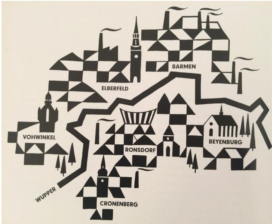
Fig. 2: Illustration found in an old tourist brochure, probably late 1950s. Photo: D. Nicolai.