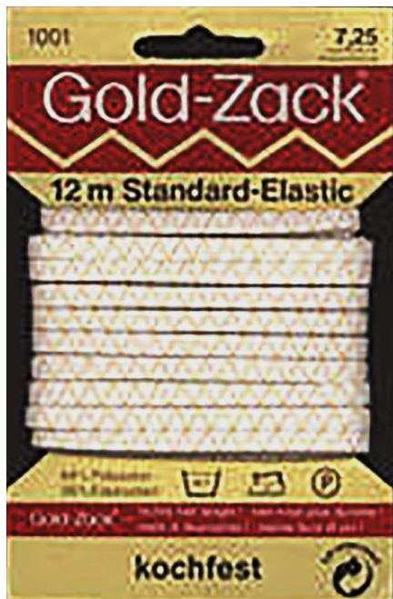
Fig. 3: Goldzack Elastic.