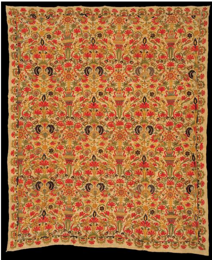
Fig. 3: Bedspread, silk embroidery on linen & cotton. Crete, late 17th-early 18th c. Benaki Museum (inv. no 32646), gift of Christopher Tower.

Details about the standard of living of this new Cretan class are available to us through notarial documents of the time – wills and dowry agreements – that record the imported luxury goods to which the bourgeoisie and the aristocrats of the Cretan cities had access (Mertzios 1961-62, 228-308). Out of these, we will focus on references to imported fabrics such as satin, velvet or damask, or even entire garments (Macha 2009, 254; Maltezou 1986, 139-47). Samples of these fabrics have not survived in museum or private collections. However, a rare embroidery with a dense, repetitive pattern of motifs throughout the fabric, which is preserved in the Benaki Museum (Delivorrias and Georgoula 2005, 166), seems an attempt to copy some precious silk cloth, whose production would not have been possible in Crete (fig 3)