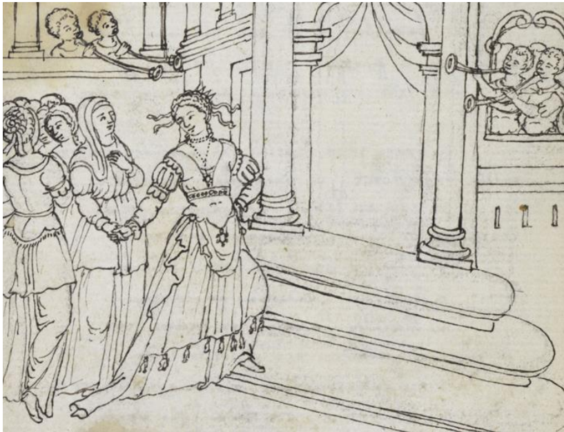
Fig. 10: Illustration of the 1710 Erotokritos manuscript, representing Aretoussa, the main female character, with her outer dress gathered up. British Library, Harley MS 5644.

in the 17 th century, probably pleated, made of red felt or even of a more precious fabric, which would be probably gathered up in various occasions (Fragaki 1960, 48-9, Macha 2009, 257). The use of this garment, quite close to the reddish dress described one century later by Tournefort, as noted by Macha, is confirmed by the existence, in more recent years, of various types of red skirt (fig. 9), which the two scholars consider to be its survival.