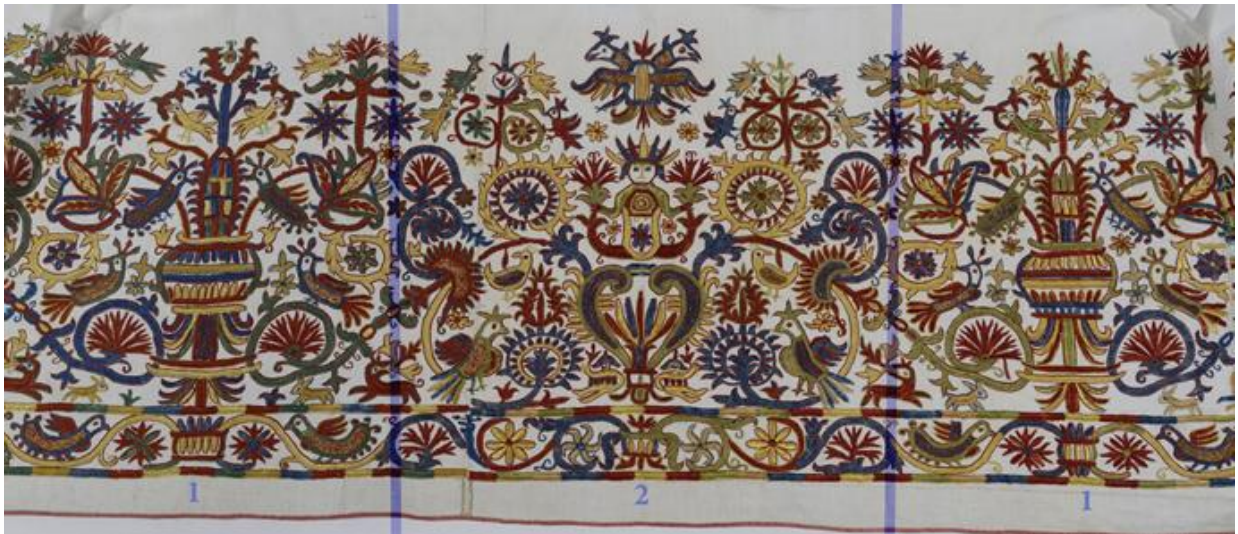
Fig. 2: Detail of the EE872 dress border.

There is no space here for a detailed description of the dress. We will only say that it is made of a white linen-cotton cloth in a tabby weave with a hem richly embroidered in silk thread in a horizontal band 45cm high, with two elaborate compositions that are repeated throughout: one with a flowering vase as the central subject and another with a fork-tailed mermaid (fig. 2).