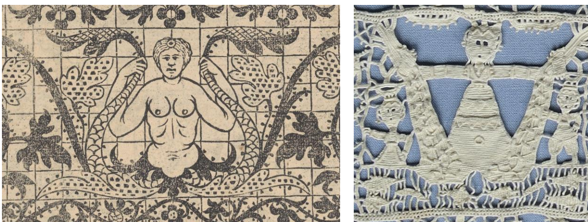
Fig. 5: Wood cut design for lace (detail), Metropolitan Museum of Art (acc. no 29.5.91bis[27]) (Pagano 1556, 14 [recto]) (a). Embroidered lace, reticella, Venice, late 16th c. (detail). Benaki Museum (inv. no EE3027) (b).

As central subjects in the densely embroidered hems of the Cretan dresses, we can easily recognise flowering vases, which are stylistically similar to corresponding compositions that were very common in the Renaissance repertoire of Italian lace in the sixteenth century, as we mainly find in pattern books for lace and embroidery (for examples see Johnstone 1961, pl. 78 and compare with Abegg 1978, 67, figs. 91, 92, 94). What is interesting, however, is the dissemination of certain specific subjects, which also correspond to Italian lace through which, apparently, they spread to Cretan embroidery: the double-headed eagle (fig. 2, 4) and the mermaid or siren with a forked tail (fig. 2, 5). We will focus more on this last subject, which was transferred from medieval manuscripts illustrated with animals and monsters to pattern books for embroidery and lace printed in Venice in the sixteenth century.