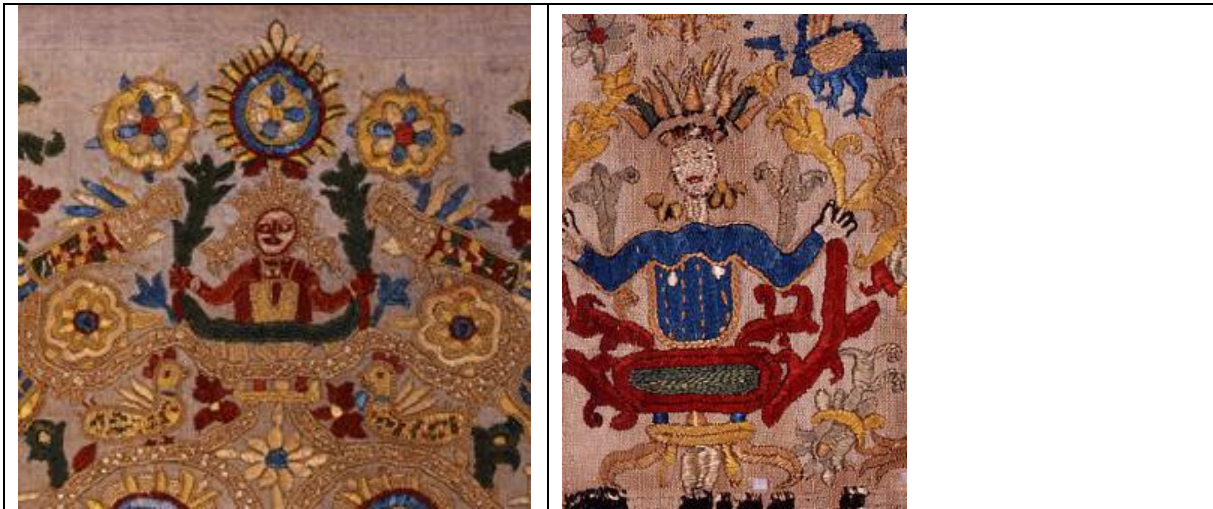
Fig. 6: Dress borders, silk embroidery on cotton & linen (details). Crete, late 17th-early 18th c. Benaki Museum (inv. nos EE3389 [a] & 26111-gift of Maria Matzouni [b]).

This subject seems to have particularly impressed the embroiderers of Crete, since we find it in many variations. The figure usually wears a crown (fig. 2, 6b, 7) and is sometimes assimilated into the surrounding foliage (fig. 6, Zora 1960, 348-9), while, according to some scholars (Wace 1935, 33), she is very often transformed into the figure of a woman, dressed in a simple peasant costume, the only vestige of her previous existence being the gesture of her outspread, raised hands, which no longer hold the edges of a double tail, but two blooming branches (fig. 7).