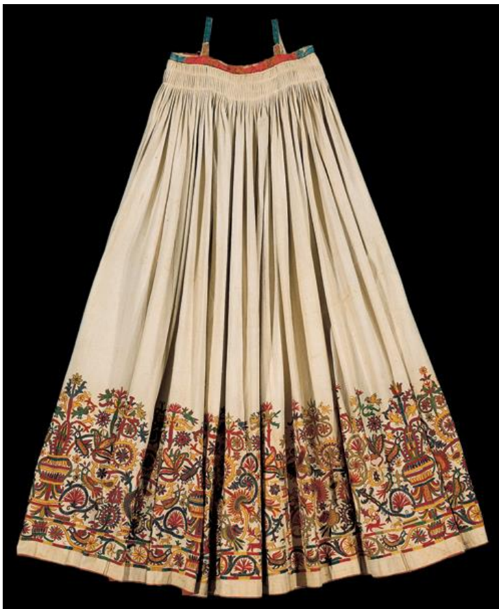
Fig. 1: Dress, linen & cotton, with silk embroidery. Crete, 17th-18th c. Benaki Museum (inv. no EE872), gift of George II.