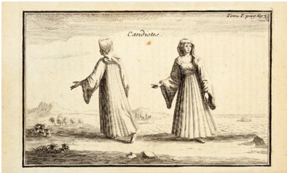
Fig. 8: Pitton de Tournefort, Women of Candia , engraving, 1718. Benaki Museum (inv. no 40776).

of reddish cloth, full of pleats, hung on the shoulders by a couple of thread-laces” (Johnstone 1972, 29), a description that might fit the drawing but not so much our dress, unless we assume, like Pauline Johnstone, that the embroidered dresses that are preserved in museum collections are bridal or festive variations of the monochrome reddish dress described by Tournefort (Johnstone 1972, 29).