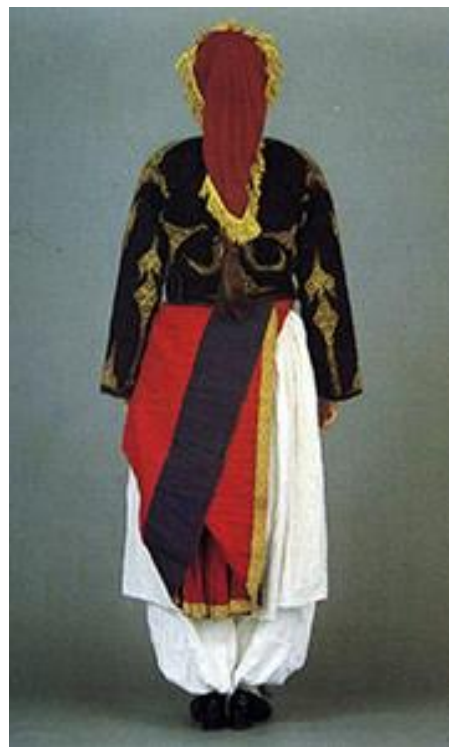
Fig. 9: Early 20 th -c. postcard representing an old woman with the Kritsa costume, including a kouda skirt gathered up (a). Female costume, with a sartz skirt gathered up in the back. Anogheia, Central Crete, late 19th c. (b) Peloponnesian Folklore Foundation.

In the attempt to reconstitute the lost ensemble, of which the pleated dress of the seventeenth to eighteenth century is a part, some theories have already been proposed. It is worth looking at Evagelia Fragaki’s theory which has also been reformulated by Nantia Macha. The two scholars take as a starting point the “karpeta”, a dress or skirt worn in the Cretan countryside