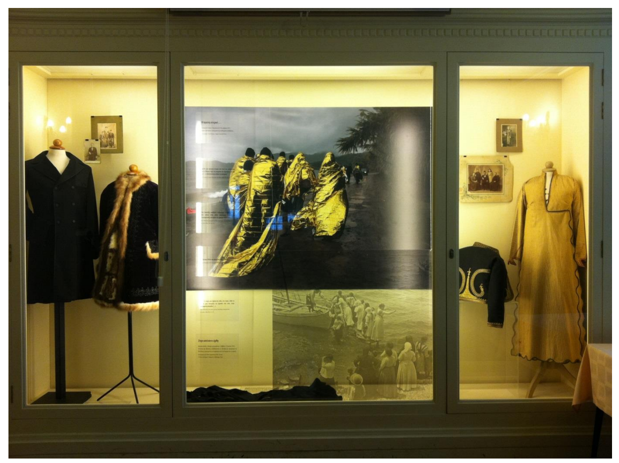
Fig. 7: Glass display titled 'The first land' at the Lyceum Club of Greek Women in Athens, dedicated to the refugees on Lesvos island.

The middle section of the display is dedicated to contemporary refugees who, like their Asia Minor predecessors a hundred years ago, have followed a similar route. The middle section contains two big photographs of people on the move, one contemporary in colour, depicting them wrapped in gold foil blankets, and one black-and-white, depicting them boarding on a small boat to cross the sea to Lesvos. By juxtaposition, a narrative of continuity of migration is constructed. What is more, the argument of continuity is reinforced by the creation of an aesthetic unity through a yellow and black synthesis of elements in the whole of the display. The politics of this display lie on the idea that contemporary refugees are placed in the same category with those who came from Asia Minor at the beginning of last century, thus inviting the visitor to read the present in the familiar terms of the past.