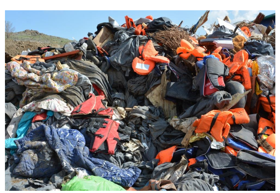
Fig. 3: A pile of clothes, life-jackets, blankets and other materials discarded on the land of Lesvos.

The dress was found among other 'garbage' of clothes, shoes, life-jackets and blankets (fig. 3). Since the beginning of 2015, hundreds of thousands of materials used for wrapping the body have been stranded on the shores of the Aegean islands, life-jackets in particular. Most people are used to the idea that clothes are thrown away and become trash because they are worn, torn or somehow damaged and cannot be mended. In this case, high quality