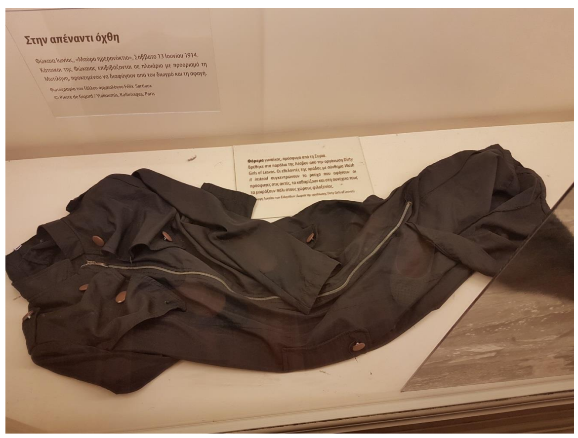
Fig. 8: The black dress at the bottom of the glass display.

Still, it should be noted that the black dress is the only garment of the display that is not placed on a dressmaker's dummy but right on the floor. Does this act contain a discrimination between humble everyday clothes, familiar to many wardrobes, and historic garments? Probably. However, placed on the floor underneath the big photograph of people walking under thermal blankets, the black dress seems as if it was left behind on purpose as refugees abandoned their wet clothes and continued their journey.