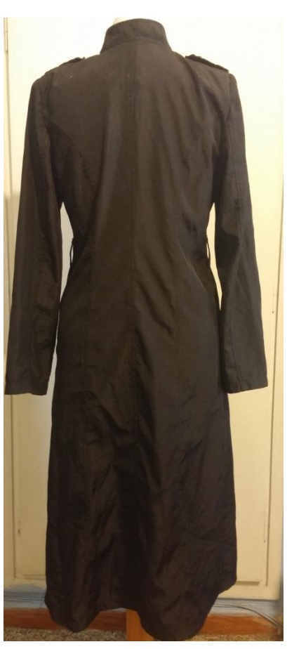
Fig. 1-2: Front and back side of the black dress that was found discarded on a shore on Lesvos island.