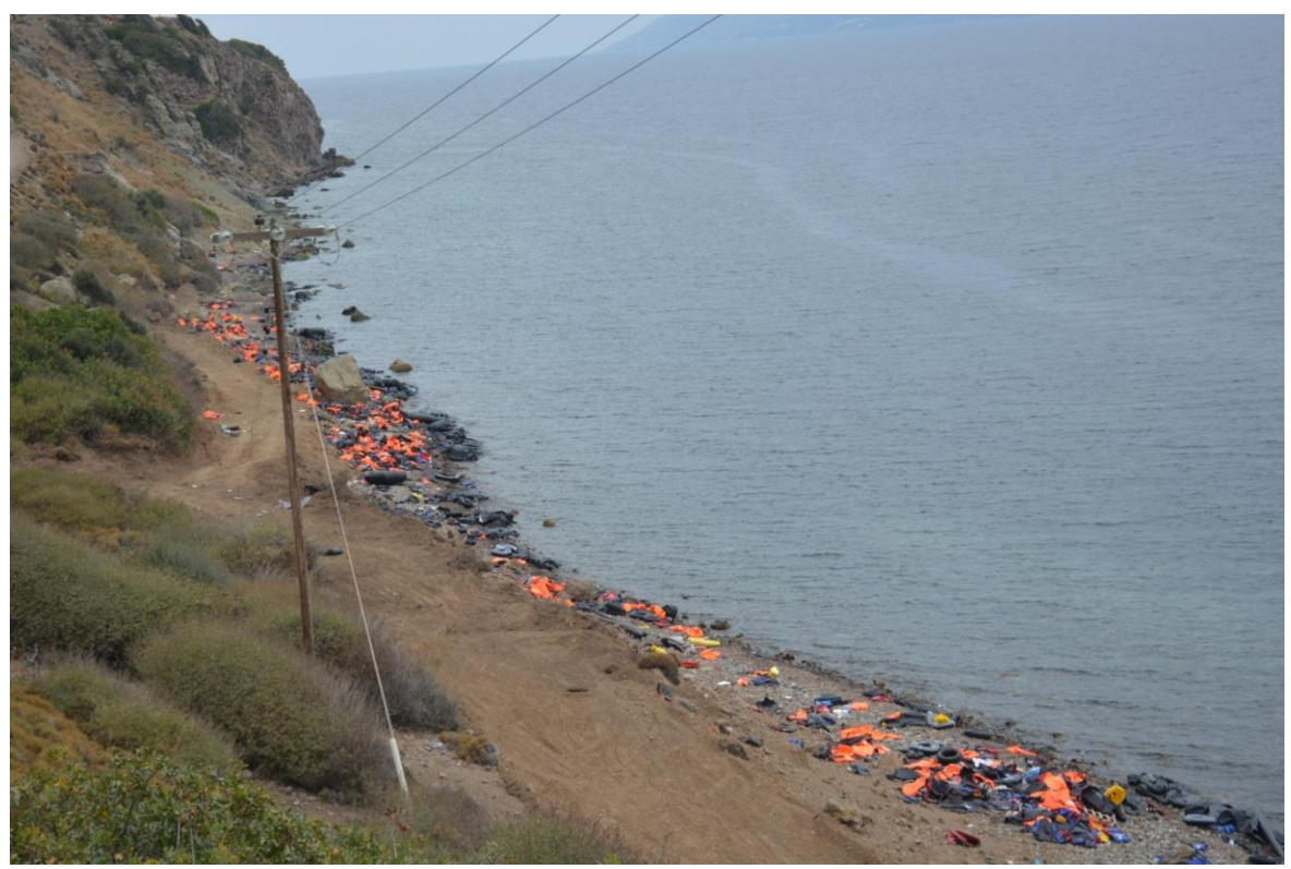
Fig. 4: Life-jackets and boat debris as traces of refugee landings on Lesvos island.

clothes in good state were discarded just because they became wet. Within the time frame of people on the move, wet clothes, shoes or bags become useless or heavy to carry, and are left behind.