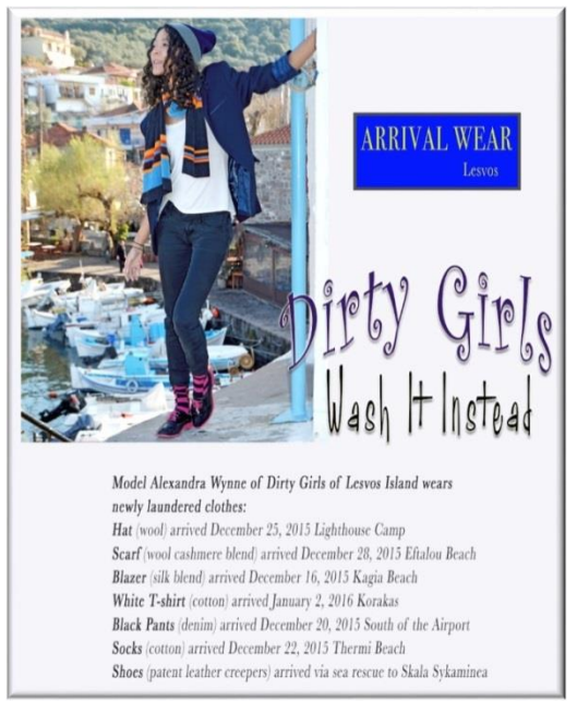
Fig. 5-6: Posters of Dirty Girls promoting the idea of washing and reusing refugee clothes.

Let us return to the black dress, which became witness to all those workings of biopolitical power that unfold among the actors of the so-called 'refugee crisis': Left on the shore as trash, the dress would have made its way to the landfill, had it not been for the Dirty Girls of Lesvos (fig. 5-6), an international volunteer organization, who picked it up to be washed. (Information on the Dirty Girls of Lesvos Island and news about its recent activities: <a href="https://www.facebook.com/pg/dirtygirlslesvos/about/?ref=page_internal">https://www.facebook.com/pg/dirtygirlslesvos/about/?ref=page_internal</a>) Witnessing good quality clothing form piles of trash rather than been saved and reused, Alison Terry-Evans, an Australian photographer, initiated in October 2015 this organization for washing and redistributing clothes, blankets, sleeping bags and other materials collected from along the shorelines and at the refugee camps. As stated on their website, Dirty Girls believe their work to be