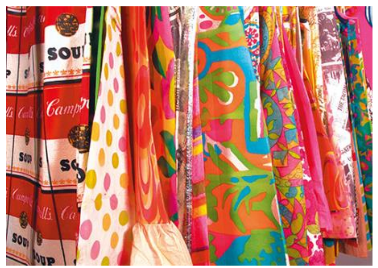
Fig. 1: 1960s Paper dresses. ATOPOS collection.

Introduction / History / Materials / Designs / Decline / Contemporary Pieces in the Collection / Ethnological Pieces in the Collection / RRRIPP!! Exhibitions / Exhibition Catalogue