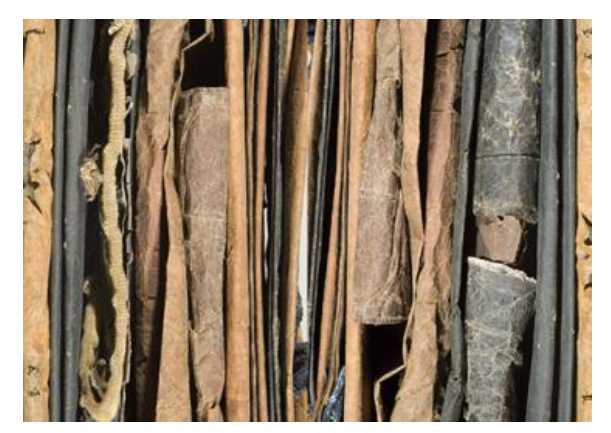
Fig 6: Paper Kamiko coats. Japan, 18th-19th century. ATOPOS collection.

These rare pieces and other historic items of the RRRIPP!! Collection serve not only as examples of the use of paper in the manufacture of clothing, but also as a surprise and a delight for the viewer.