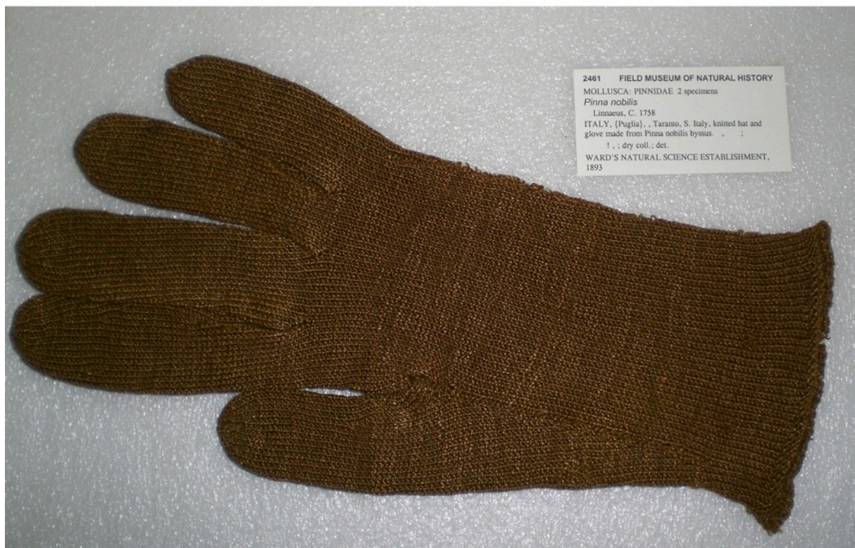
Figure 3: Knitted glove, sea-silk. nineteenth century, Taranto (The Field Museum of Natural History, Chicago)

Nearly all sea-silk items are found in natural history museums spread across Europe, rather than in textile collections. One reason is certainly, that in past centuries, sea-silk textiles were often gifts between elites or souvenirs from Italian travellers on Grand Tour. These items were kept together with the shells in private cabinets of curiosity, which for their part formed later the foundations of the first natural history museums in Europe. In the United States, sea-silk items bought in Italy by entrepreneur collectors were presented at different industrial exhibitions. One example is a collection of sea-silk items shown at the world exhibition in Chicago 1893. A knitted pointed cap and gloves and a fur-like muff were later sold to Marshall Field, the founder of the Field's Museum of Natural History in Chicago (Maeder 2009). (Figures 3 and 4)