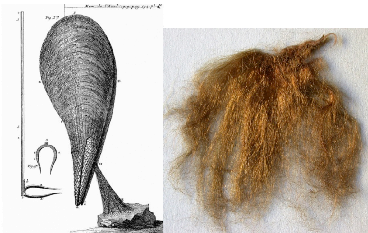
Figure 1: Pinna nobilis L. with fibre beard (byssus) and cramp (de Réaumur 1717) and Figure 2: Sea-silk: washed and combed fibre beard (byssus). EMPA St. Gallen

Sea-silk is a product of the noble pen shell Pinna nobilis L. (Šiletić 2004). (Figure 1) This bivalve is the largest shellfish of the Mediterranean, where it is endemic. The sedentary mollusc stands upright in the sea grass weeds along the coast, with almost one third buried in the sand. To withstand the flow, it fastens itself with a beard of very fine, strong filaments in the ground. These fibrous tufts, zoologically called byssus , with a length of up to 20 cm, constitute the raw material for sea-silk. The tufts cut off the mussel have to be washed several times, dried, combed and spun like other natural fibres. The result is a fine, resistant textile material, once famous and highly appreciated for its natural iridescent, brown-golden colour. (Figure 2) The pen shell Pinna nobilis L. is protected since 1992, prohibiting a reanimation of the sea-silk production.