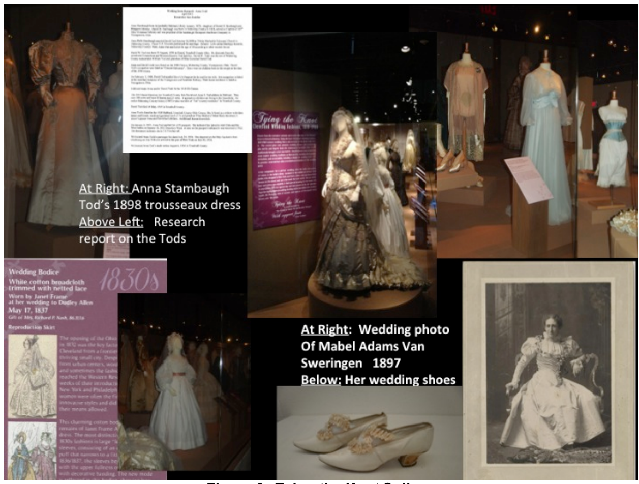
Figure 9: Tying the Knot Collage

The WRHS has an excellent research library, which combined with the accessibility of online research, generated historical information on a number of the artifacts that was unknown or incorrect at the start of the exhibitions. Many pieces in the WRHS clothing collection, like those in so many other collections, lack specific information as to the wearer or important details about when a garment was worn. What we found was that combining the museum's object files and donor records with genealogical research can turn up surprising information. For Tying the Knot , I wanted all of the items used to be linked to a specific wearer and we were able to do that. For the wedding and trousseaux dresses I also wanted to use only ones for which we could find the couples' wedding date. Each label also tied the couple's lives to changes in Cleveland Society during that decade, as well as featuring information about how this specific wedding dress fit into the fashion choices that were available to the bride.