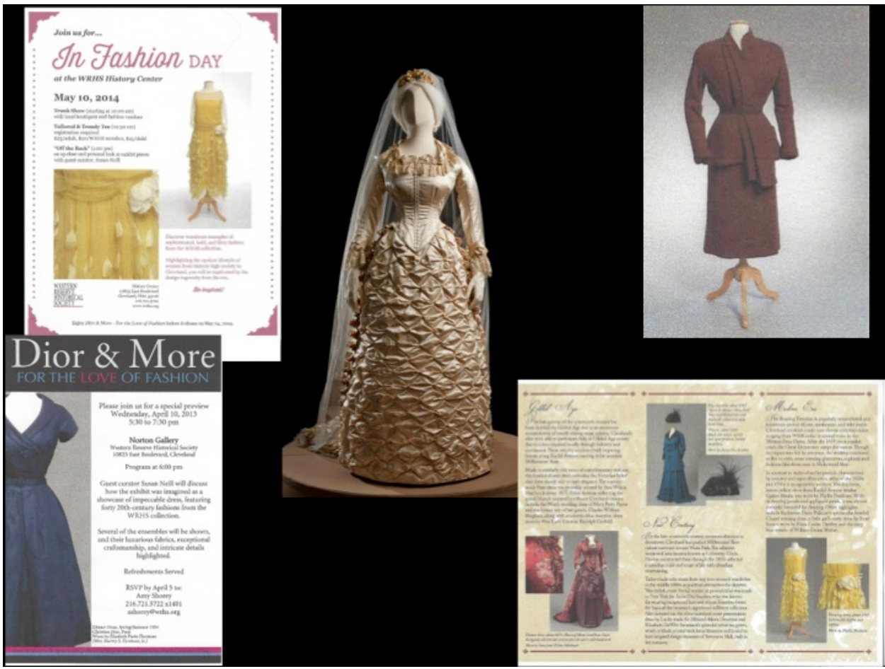
Figure 7: Professional Photos and PR Pieces Collage

visits, the main focus was to check out potential the outfits that the curator had identified from the database and to do the initial try-on of the garments, assess their condition, select accessories, and to do documentary photos that we could work with when we were again in our home studios. Because the workroom was on another floor from the collection storage, often the garments were tried on at the front part of the area where they were stored, as you can see in some of these photographs. And as you can see in other photos, during these sessions, we got glimpses of the types of dressing issues we might face.