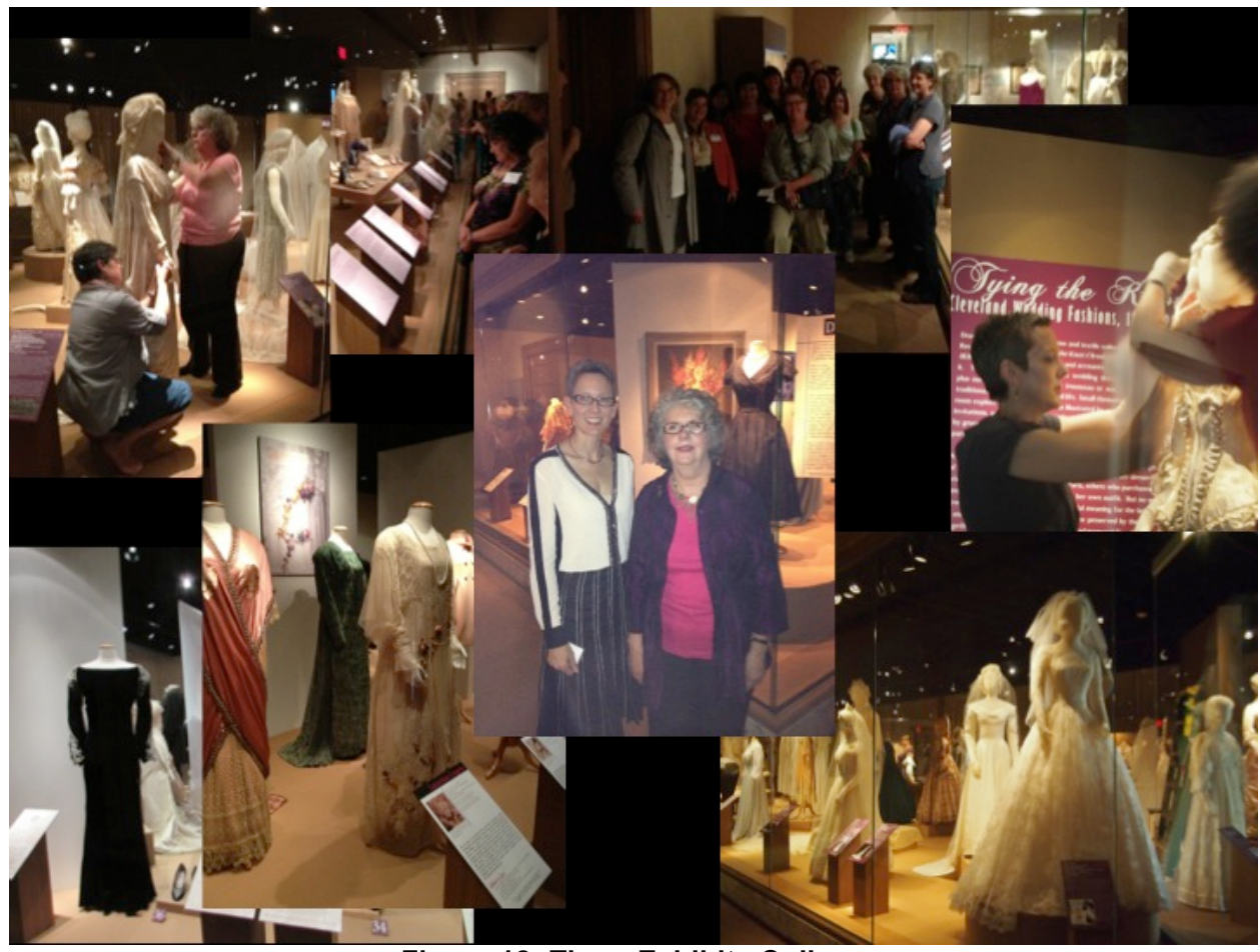
Figure 12: Three Exhibits Collage

There is much more I could talk about but suffice to say we had a great time working at WRHS, the exhibits were all successful as far as the museum was concerned given the attendance numbers and visitor response, and we felt gratified that we helped to fill in gaps in documenting the garments, their makers, their place in fashion history, and their context in Cleveland history.