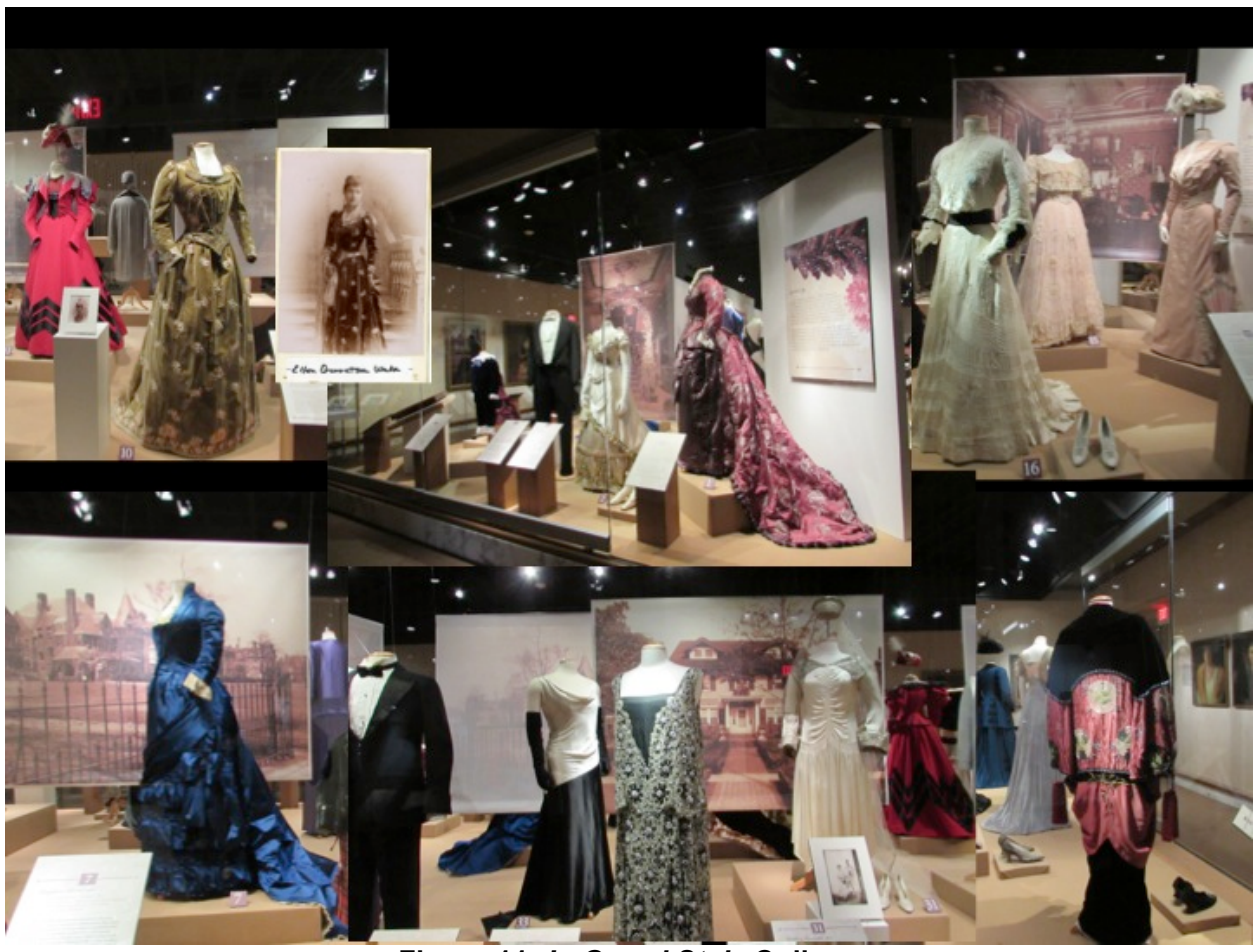
Figure 11: In Grand Style Collage

For In Grand Style , which focuses on the period of Cleveland's heyday from the 1870s to about 1930, part of the exhibit design was scrims with the images of the types of houses the wearers lived in on Euclid Ave, AKA Millionaires Row, and later in the University Circle neighborhood. Again, more information surfaced on the individual garments and their wearers as we linked them to their status as part of Cleveland's elite.