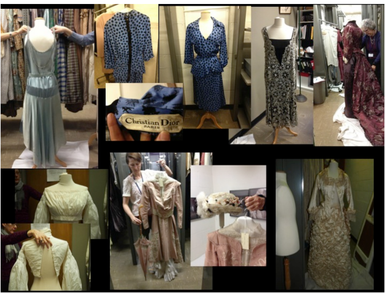
Figure 6: Initial Try-ons and Pre-dressing Collage

The work our three person curatorial team did for Tying the Knot in the seventeen weeks from the end of February to June 21<sup>st</sup> became the guide for the work needed to curate and install a contract costume exhibition at WRHS. Adjustments were made for the other two exhibitions which had longer lead times but several elements were common to each exhibition. Of course a great deal of work was done from our home offices using the Internet to access the museum's collection database and communicate via email among ourselves and with the WRHS staff.