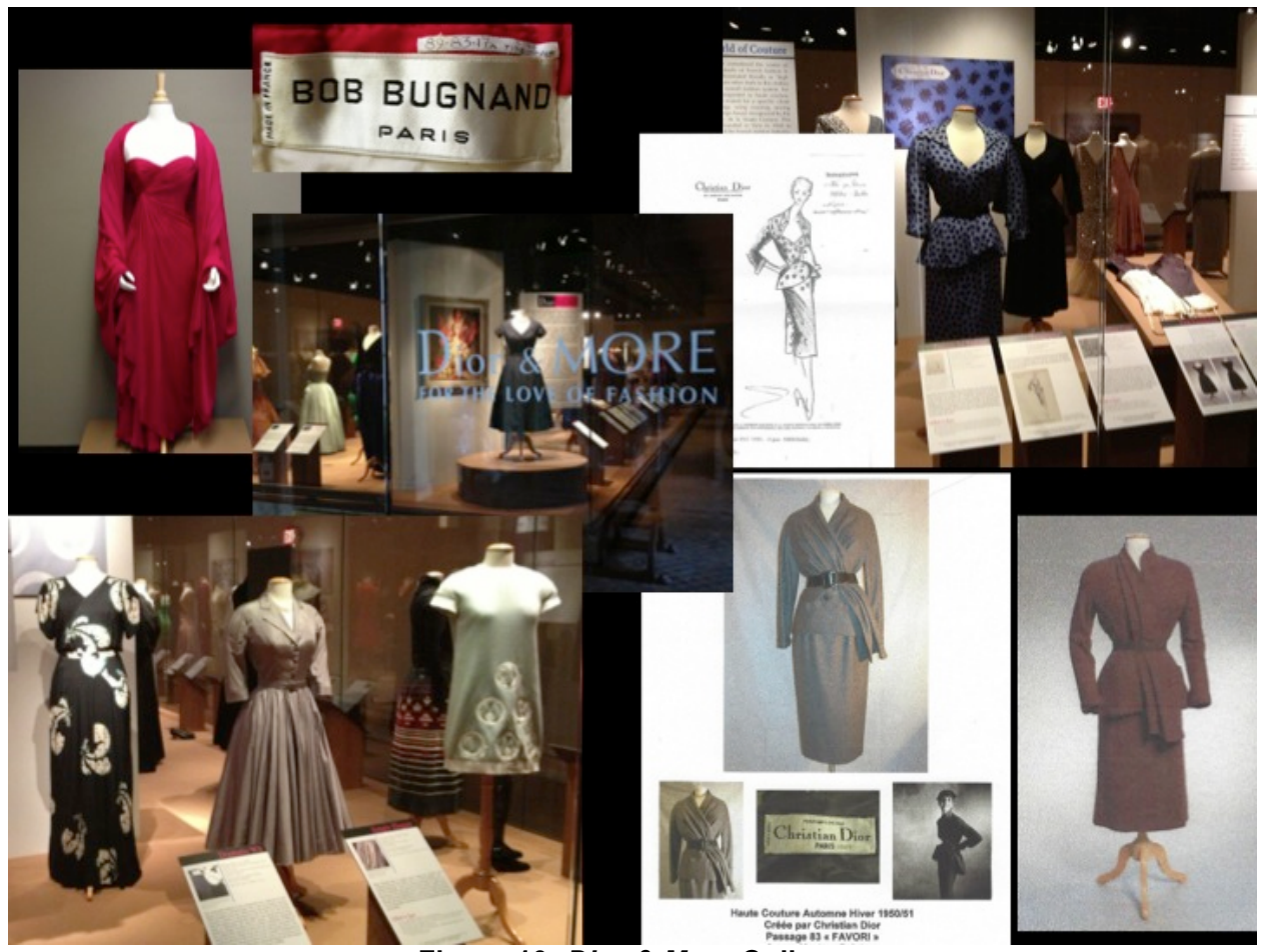
Figure 10: Dior & More Collage

Susan used the research library in somewhat different ways. For Dior & More she researched the women who wore the dresses and their positions in Cleveland society, plus she did considerable on-line research into the designers of the garments, uncovering some interesting connections to their Cleveland clients, like that Lucile, Lady Duff Gordon, traveled to Cleveland to meet with the client whose dress was featured in the exhibition.